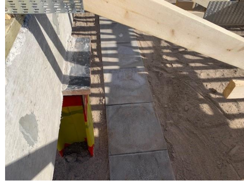
Concrete Paver Installation in Crawlspace