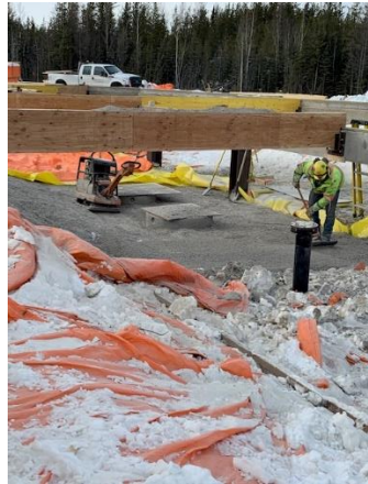
Backfill and Compact Subbase Material in Crawlspace