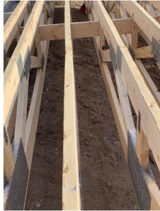
Strong Back Installation on Floor Trusses