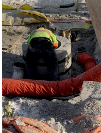
Grout Risers on Sump Pits