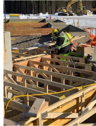
Floor Truss Installation