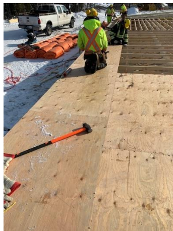
Floor Sheathing Installation