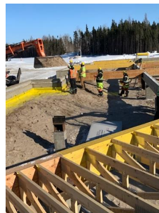
Placement of Sand over Poly