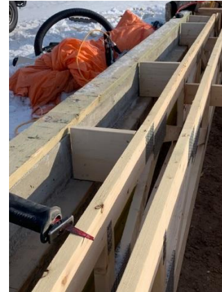
Blocking Installation on Floor Trusses