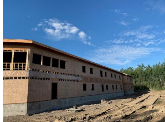
Exterior View – North West Wing