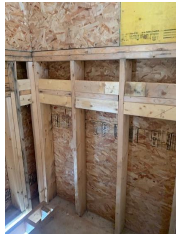
Backing Install in Stairwell No. 2 for Handrail