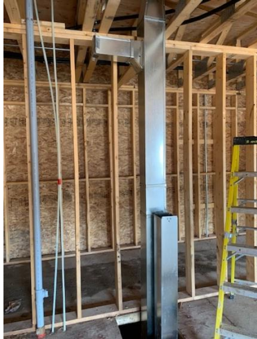
Duct Work Risers Install on Main Floor- East Wing