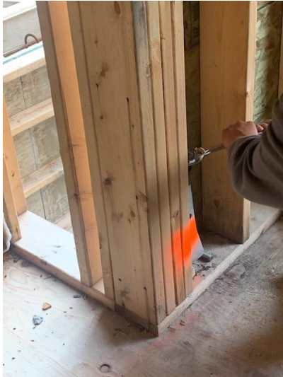
Hold Down Install on Main Floor - West Wing