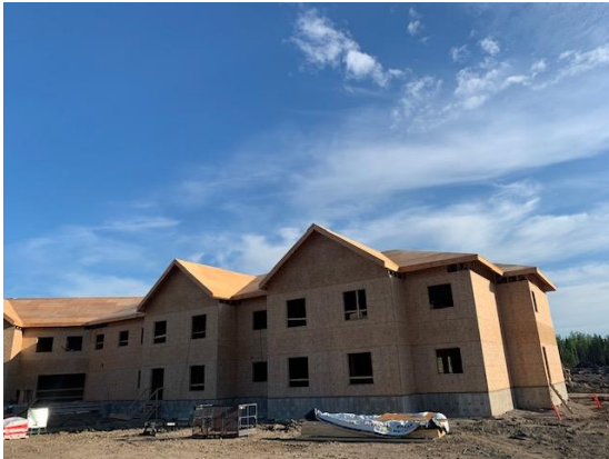
Exterior View – South East Wing