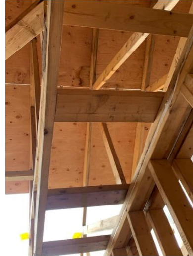
Roof Sheathing Install – North East Wing