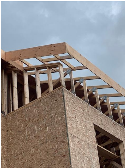
Fascia Board Install – North East Wing