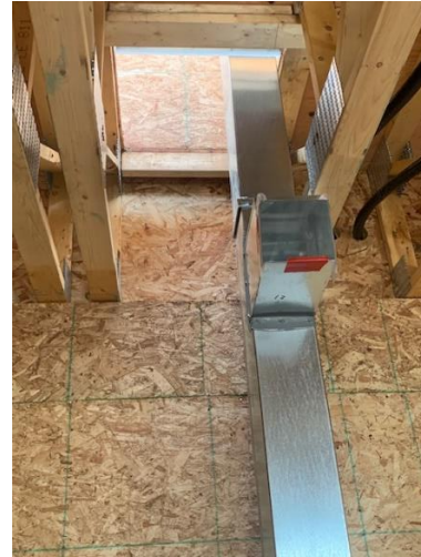
Duct Work Riser Install to Second Floor- East Wing