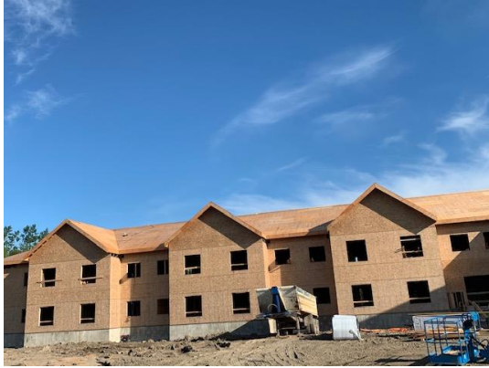
Exterior View – South West Wing