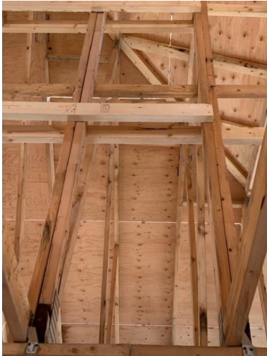
Roof Truss Bracing – East Wing