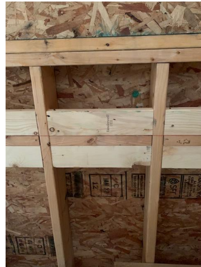
Wood Backing Install – West Wing