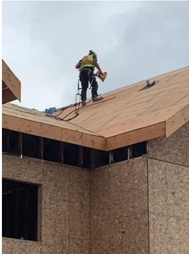
Roof Sheathing Install – Gable End- East Wing