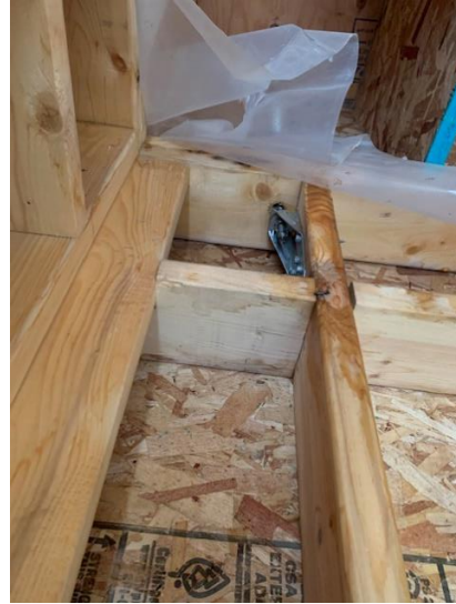
Hold Down Install to Second Floor- West Wing