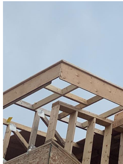
Fascia Board Build Out – North East Wing