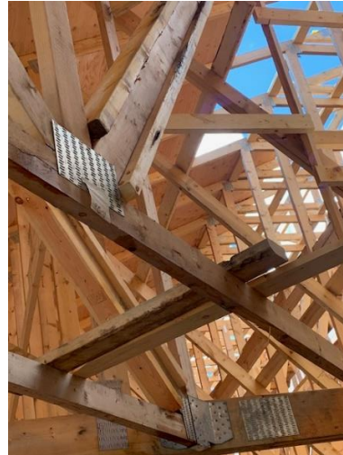
Roof Truss Bracing – East Wing