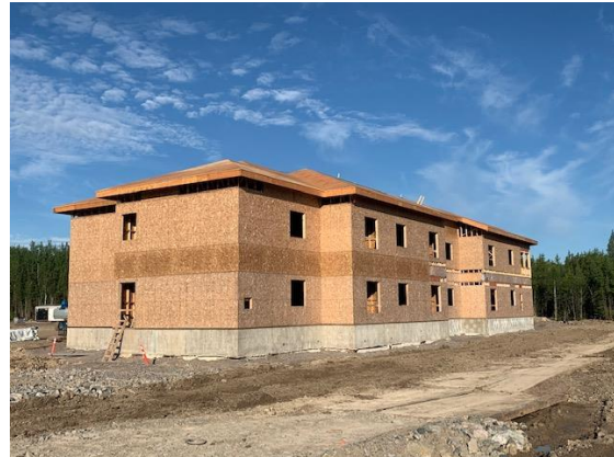
Exterior View – North East Wing