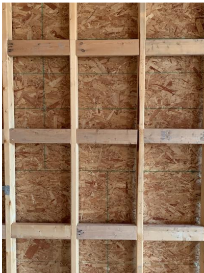
Wood Backing Install – East Wing