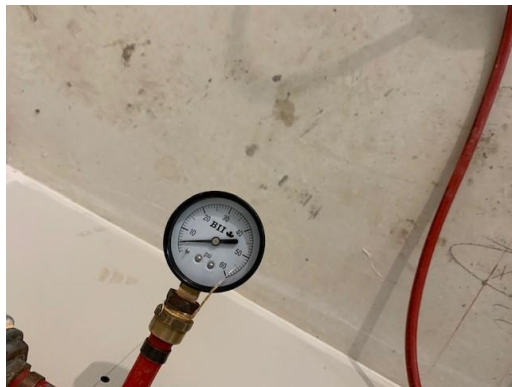
Sanitary Line Air Test – West Wing