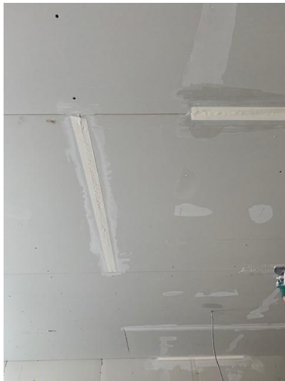
Tape and Mud Applied to Gypsum Board on Main floor Ceiling - West Wing