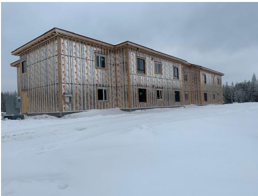
Exterior View – North East Wing