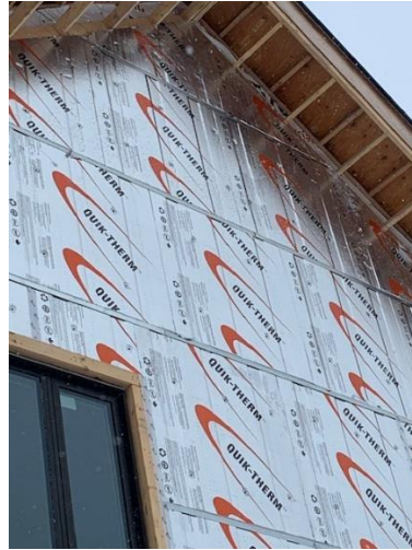
Exterior Rigid Insulation Install – South West Wing