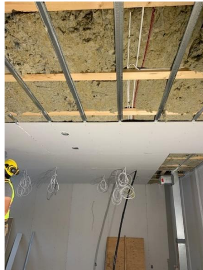
Gypsum Board Install on Main Floor Suite Ceiling – East Wing