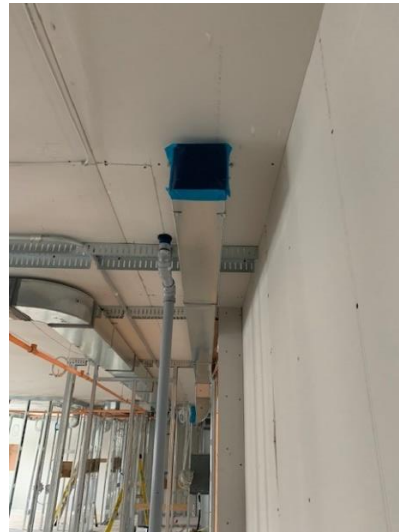
Ductwork Install in Second Floor Suite – West Wing