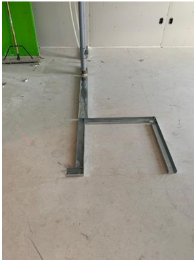
Steel Stud Track Install on Main Floor Suite – West Wing