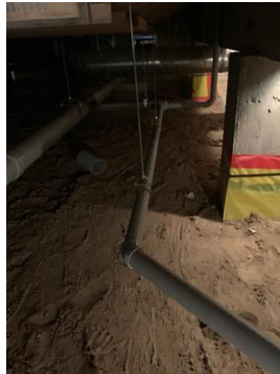
Sanitary Line Install in Crawlspace