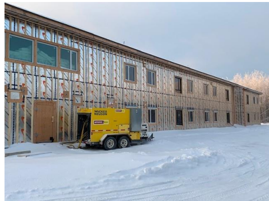
Exterior View – North West Wing