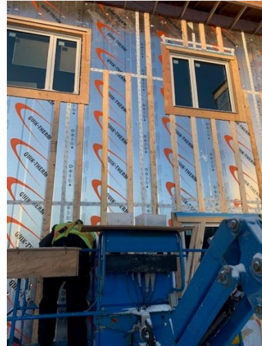
Exterior Strapping Install - South East Wing