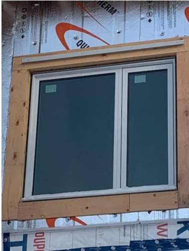
Above Window Head Flashing Install - South West Wing