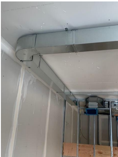
Ductwork Install in Second Floor Suite – East Wing