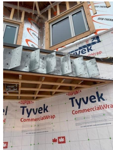
Bracket Install for Pergola