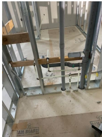
Domestic Water Line Install on Second Floor – East Wing