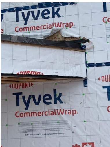
Flashing Install on Parapet