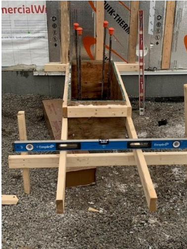
Formwork for Pergola Concrete Pad