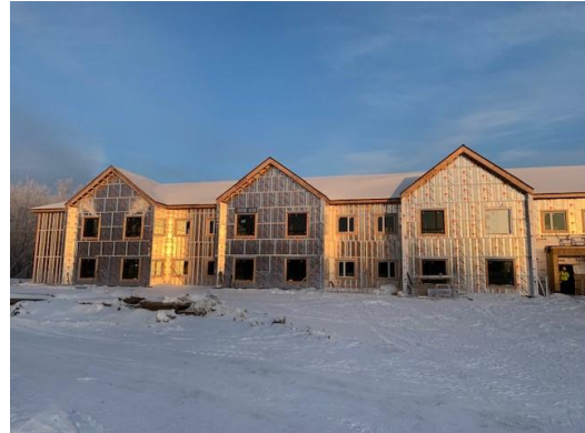
Exterior View – South West Wing