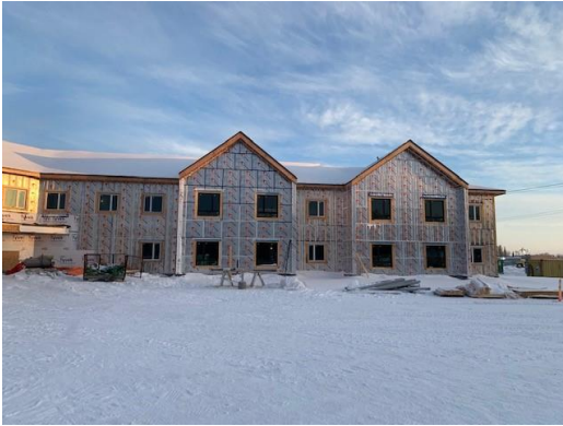
Exterior View – South East Wing