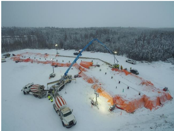
Overhead of Site of concrete pour