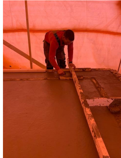
Finish work on elevator slab