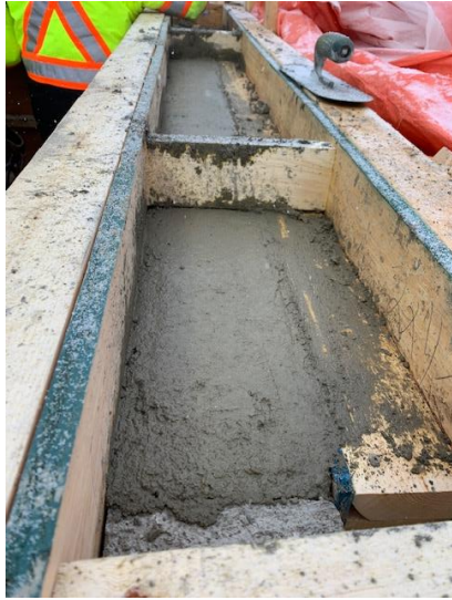
Trowel work for grade beam