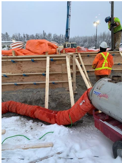
Concrete pour of grade beam