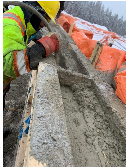
Vibrating concrete for grade beam