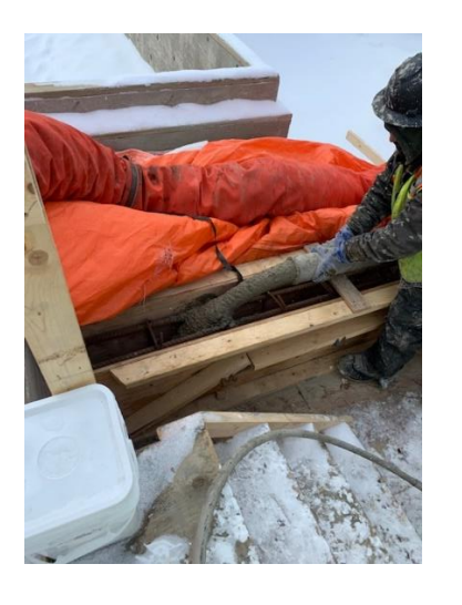
Pour concrete in center beam