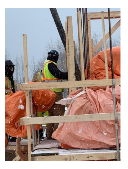
Pour concrete in elevator shaft formwork