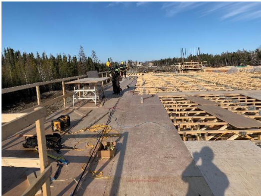
Second Floor Sheathing Install