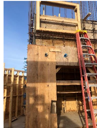
Elevator Shaft Formwork