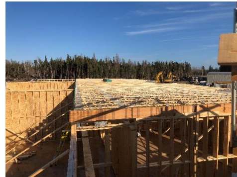
Second Floor Wood Truss Install