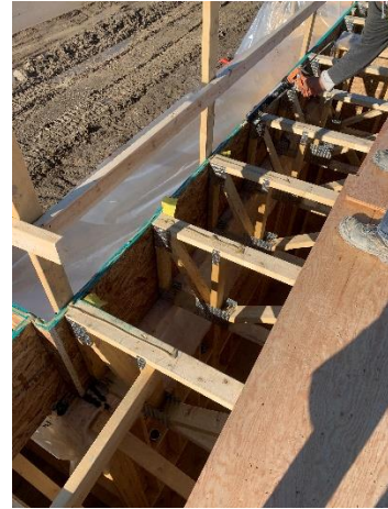
Subfloor Adhesive Applied