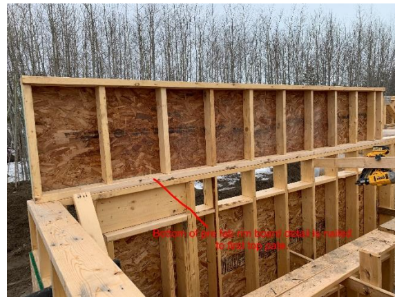
Stairwells Rim Board Install