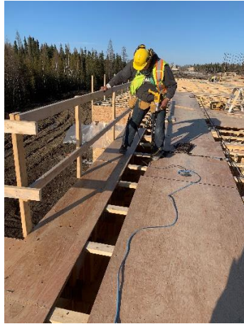
Second floor LVL Install