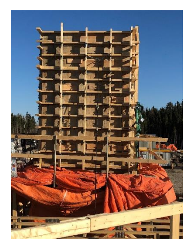
Elevator Shaft Formwork