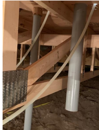
Sanitation and Domestic Water Lines In CrawlSpace