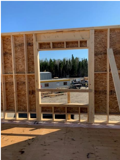
Second Floor Exterior Window – South East Side