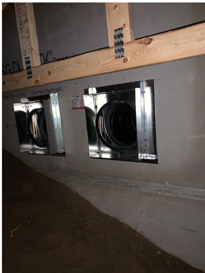
Duct Work Sleeves Installed in Fire Stop Wall in Crawlspace