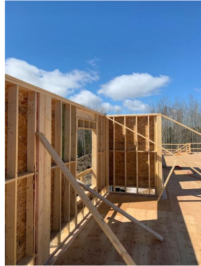
Second Floor Exterior Walls -South East Side