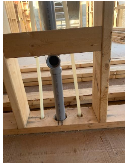
Sanitation and Domestic Water Lines With Bracing