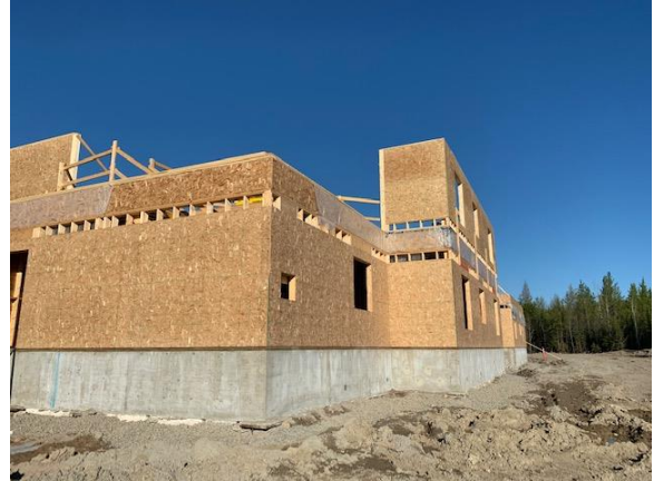
Exterior View – North East Side