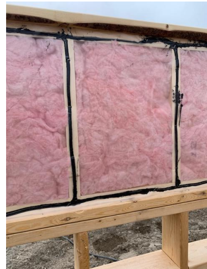
Insulation and Vapour Barrier On Rim Board -Second Floor Stair 2 East Side