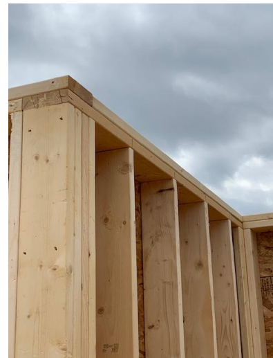
Double Top Plate Installation On Exterior Wall – South East End