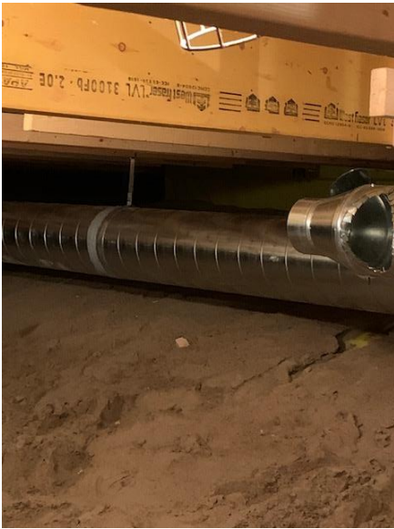
Duct Work Installation in Crawlspace