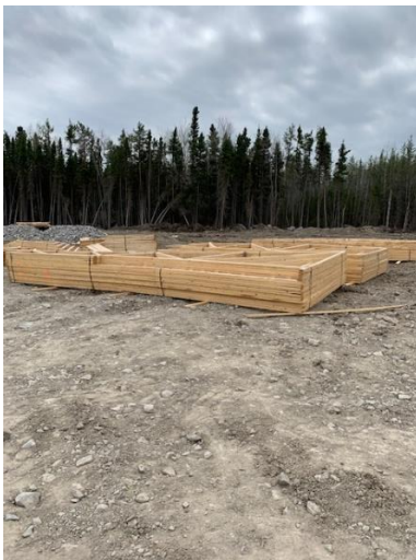
Roof Trusses on Site