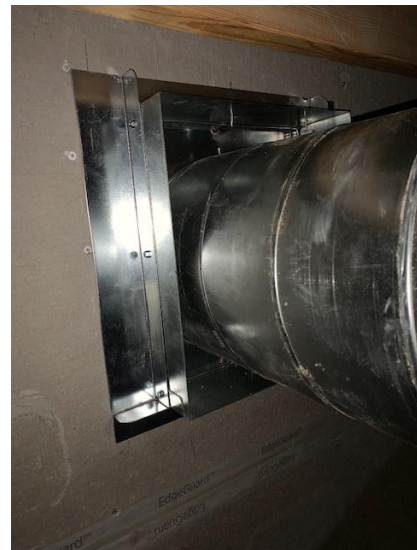
Duct Work and Sleeve Installed in Fire Stop Wall in Crawlspace