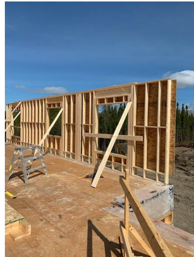
Second Floor Exterior Wall – North East End