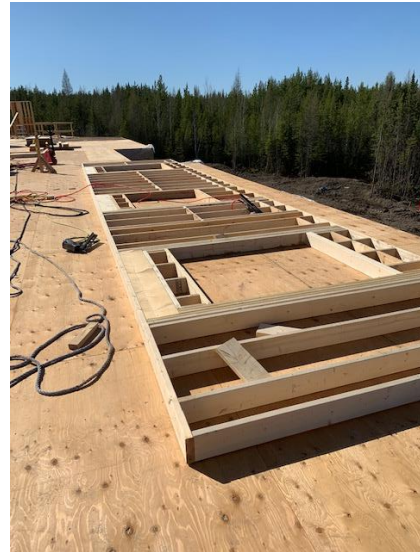
Second Floor Exterior Wall Framing – North East Side