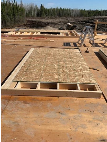
Second Floor Exterior Wall Sheathing -North East Side