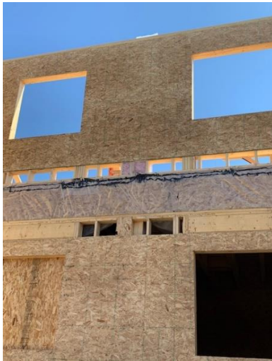
Vapour Barrier Rim Board Detail -South West Side