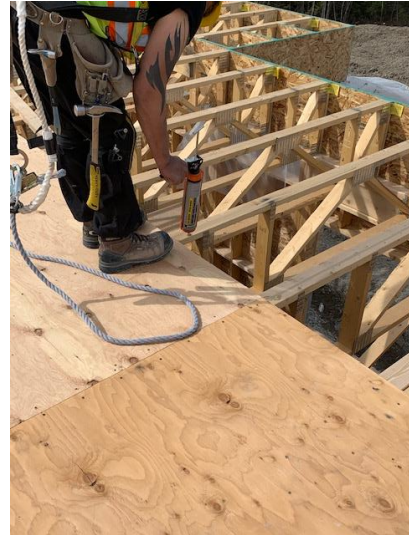
Sub Floor Adhesive Applied -North East Side