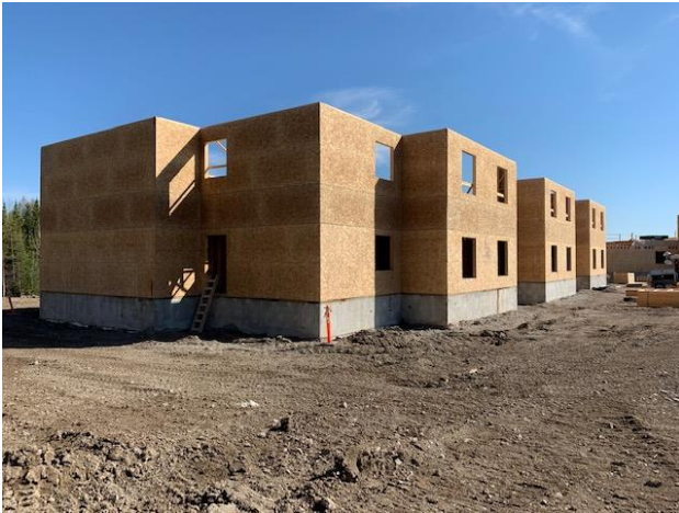
Exterior View – South West Side