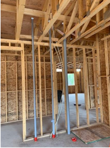
Sanitation and Domestic Water Lines To Second Floor