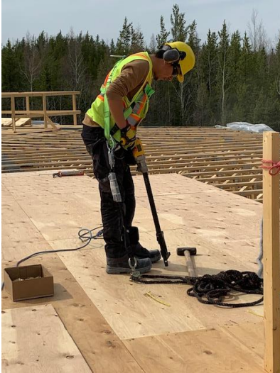
Second Floor Sheathing Install - North East Side