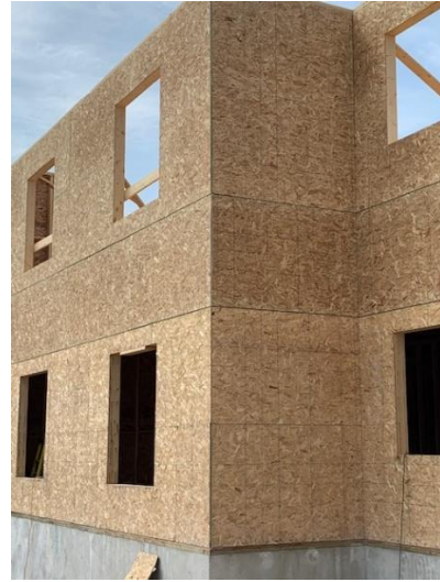
Exterior Sheathing Install Between Main and Second Floor