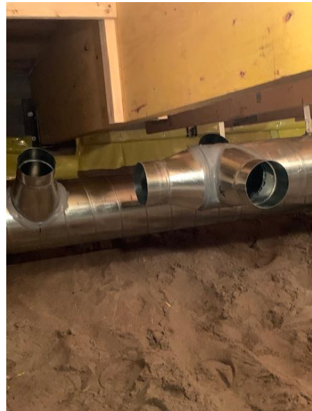
Duct Work Installation in Crawlspace