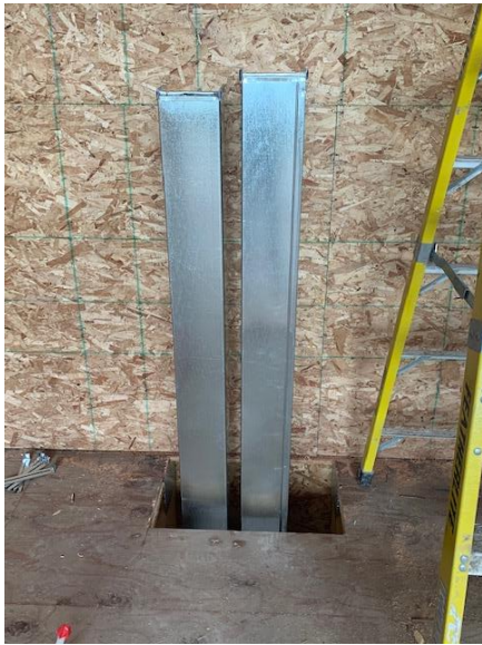
Duct Work Risers Install on Main Floor- West Wing