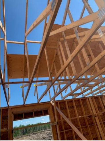
Roof Sheathing Install – North East Wing