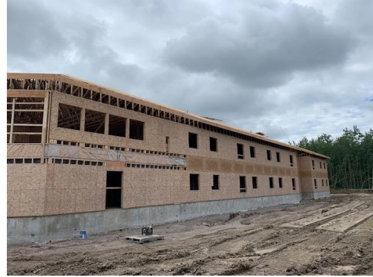
Exterior View – North West Side