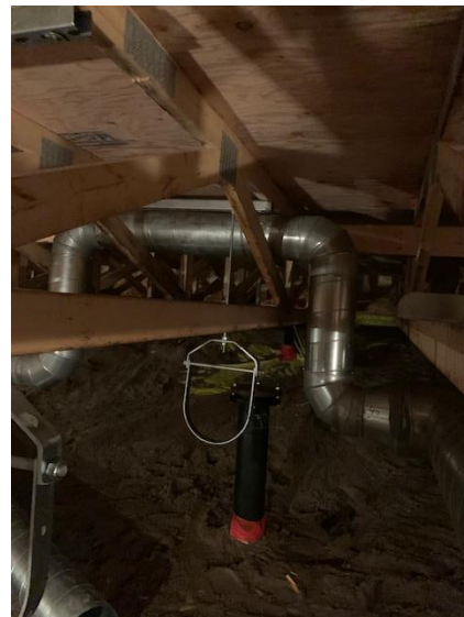
Duct Work Branch Line Install in Crawlspace – East Wing