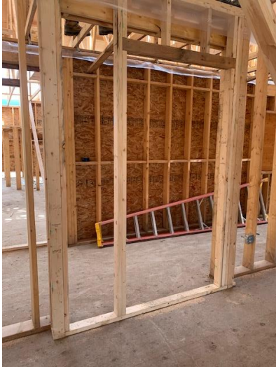
Suite Entrance Framing on Second Floor- West Wing