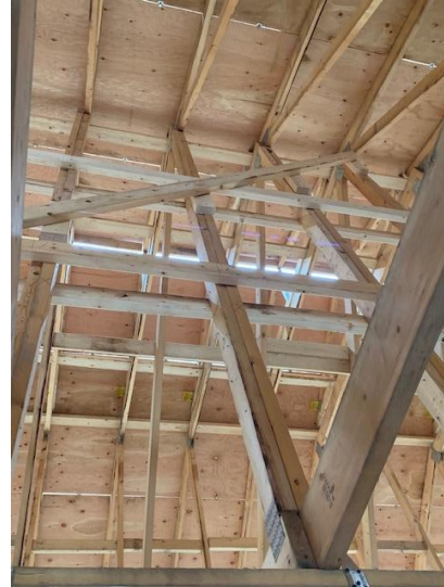
Roof Bracing Install – West Wing