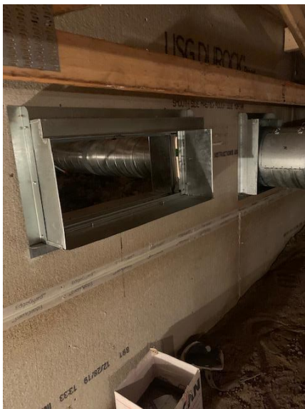
Fire Damper Install in Fire Stop Wall in Crawlspace – East Wing