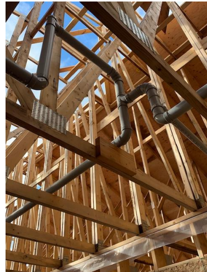
Plumbing Lines Install in Attic Space – East Wing