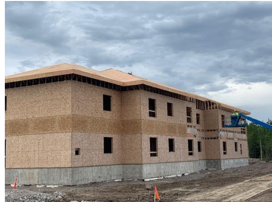
Exterior View – North East Side