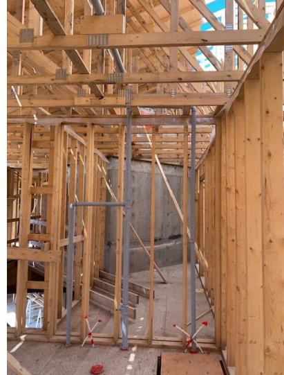
Plumbing Lines Install on Second Floor – East Wing