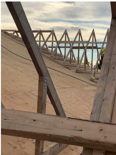
Gable End Roof Truss Install – East Wing