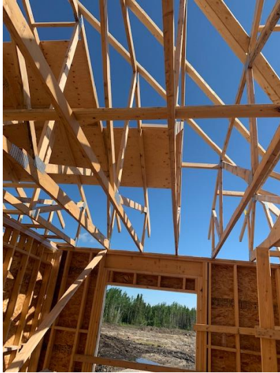
Roof Framing – East Wing