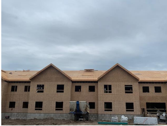
Exterior View – South West Side