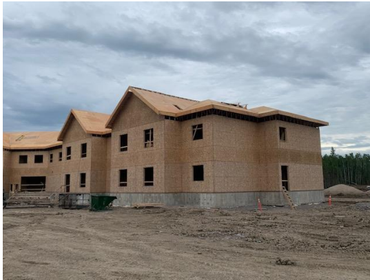
Exterior View – South East Side