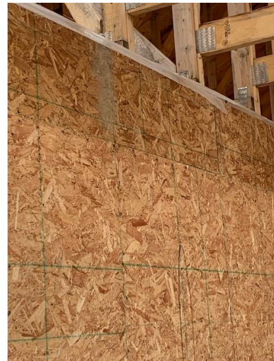
Sheathing Install on Second Floor Corridor Walls