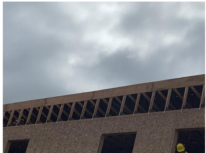
Fascia Board Install – North West Wing