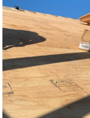
Roof Sheathing Install – South East Wing