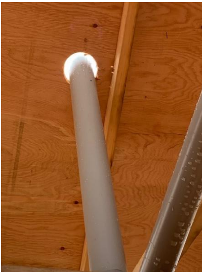
Plumbing Vent Pipe Penetration Through Roof Sheathing – East Wing