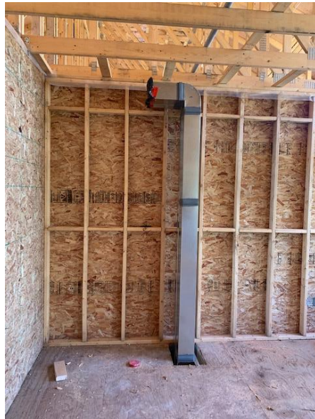
Duct Work Riser Install on Second Floor- East Wing