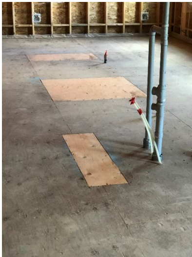
Prep Sub Floor Sheathing for Gypcrete – Main Floor – West Wing