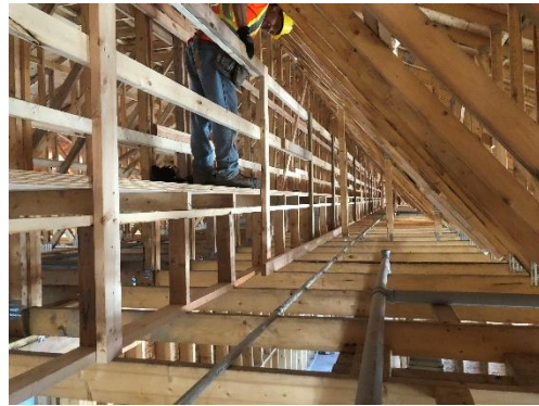
Attic Catwalk Construction