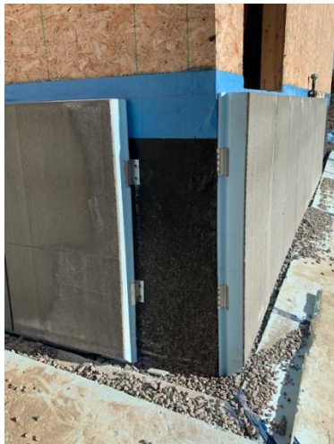
CFI Panels Install – South East End