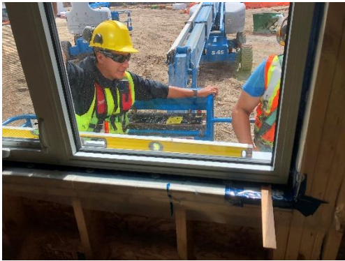
Fiberglass Window Install – South West Wing