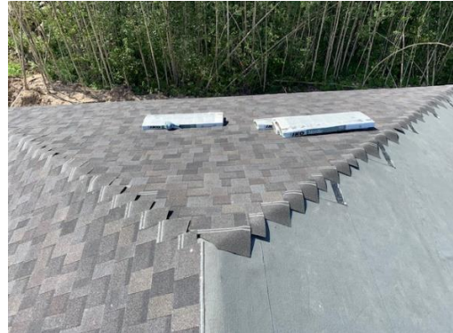
Roof Shingles Install – West End