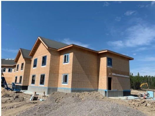
Exterior View – South East Wing