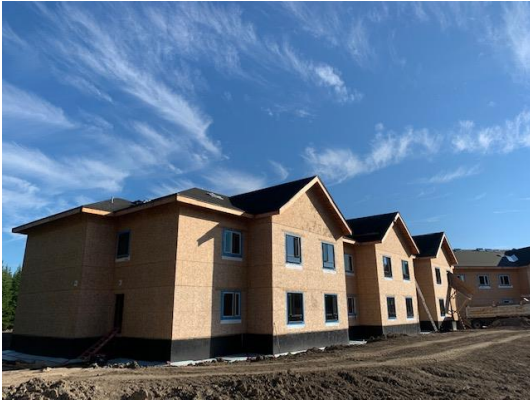
Exterior View – South West Wing