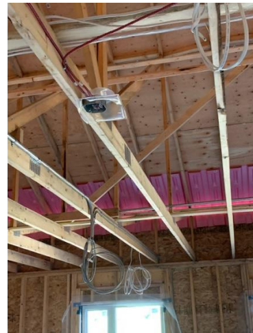
Electrical Rough-in on Second Floor – West Wing