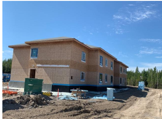
Exterior View – North East Wing