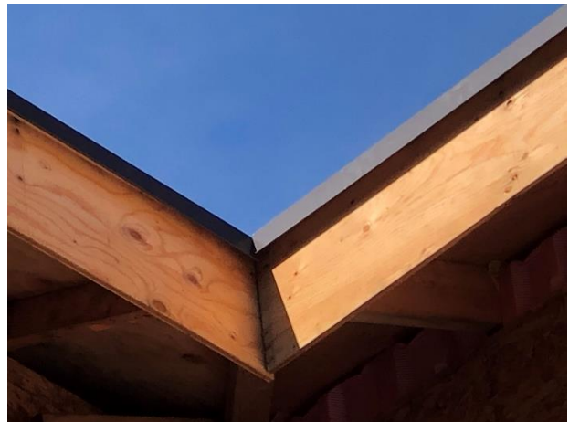
Roof Drip Edge Install – South West Wing