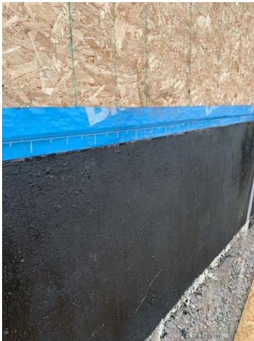
Dampproofing and Blue Skin Install on Grade Beam – East End