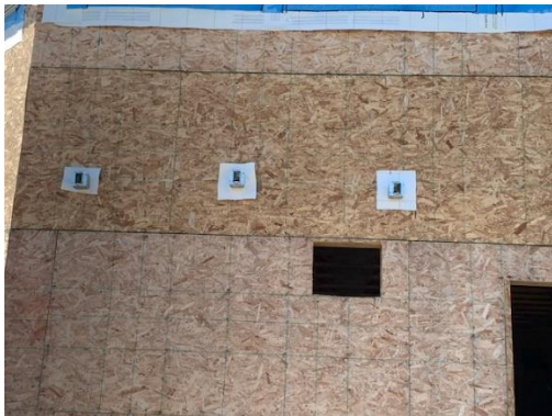
Electrical Rough-In – Exterior – North West Wing