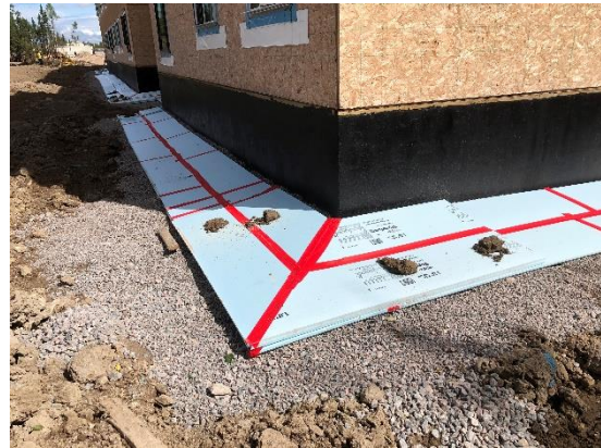
Below Grade Insulation Install – North East Wing