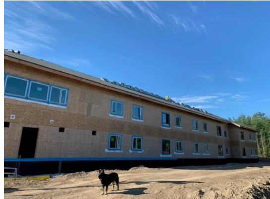
Exterior View – North West Wing