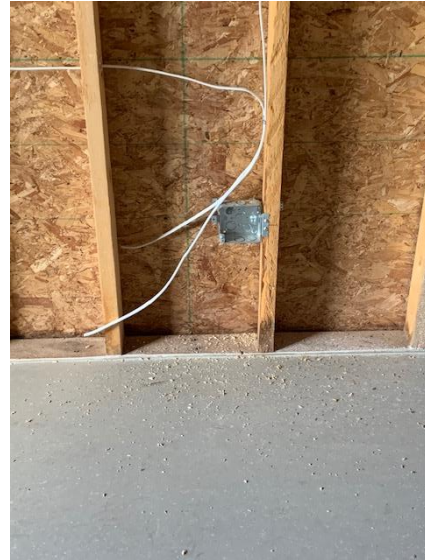
Electrical Wiring Pull on Second Floor – West Wing