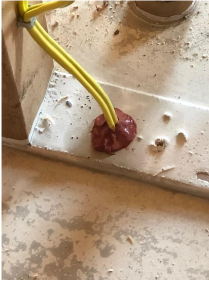
Fire Stopping Applied to Electrical Penetration on Second Floor – West Wing