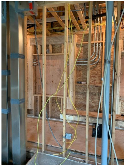
Electrical Wiring Pull on Main Floor – West Wing