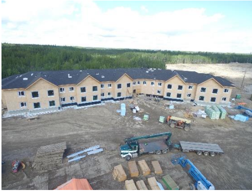
Overhead View – South Side