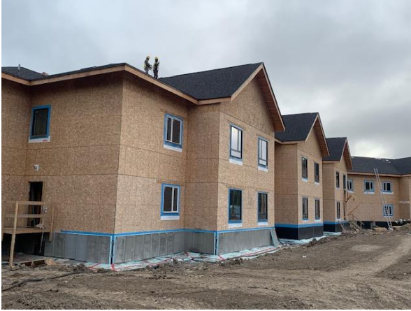
Exterior View – South West Wing