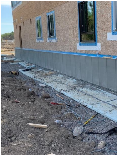
CFI Panels Install on Grade Beam – North West Wing