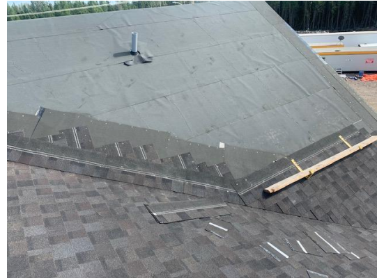
Roof Shingles Install – South East Wing