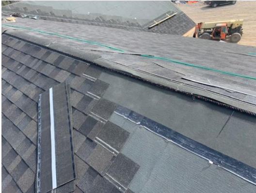
Roof Shingle Install - North West Wing