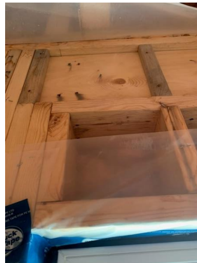
Framing Members added to Lintels above Windows