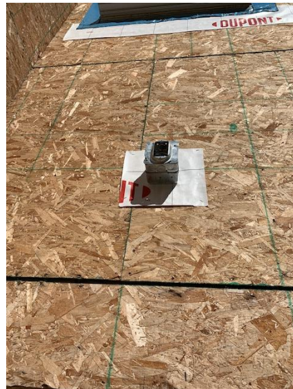
Electrical Box Install on Exterior Wall – West Wing