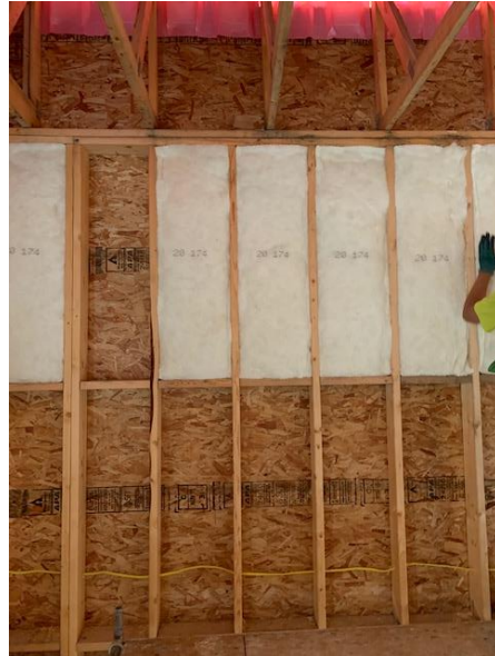
Batt Insulation Install in Stairwell No. 3 For Mock-up