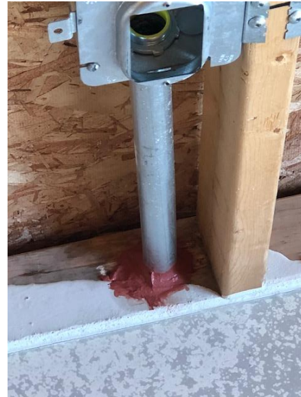
Fire Stopping Applied to Electrical Penetration on Second Floor – West Wing