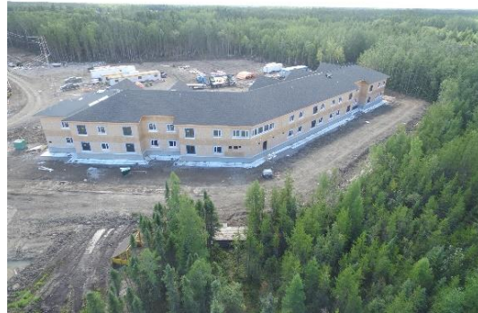
Overhead View – North Side