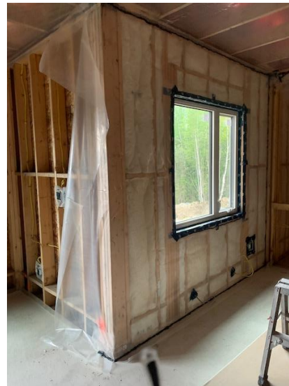
Vapour Barrier Install in Suite 2Y:16 for Mock-up