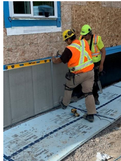
CFI Panels Install on Grade Beam – North East Wing