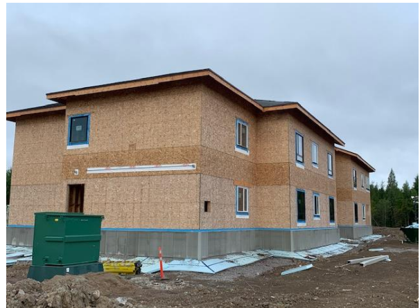
Exterior View – North East Wing