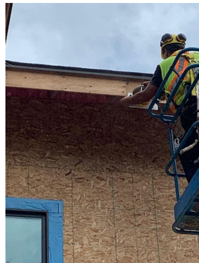
Trim Fascia Board –West End