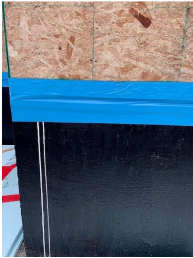
Blueskin Applied to Grade Beam – South West Wing