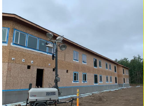
Exterior View – North West Wing