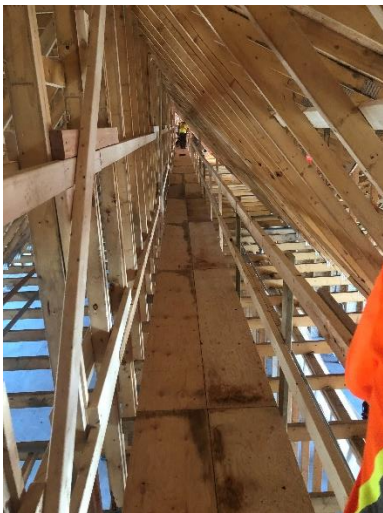
Catwalk Construction in Attic Space