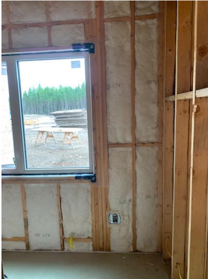
Batt Insulation Install in Suite 2Y:16 for Mock-up