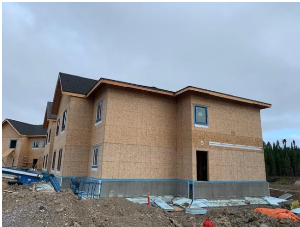
Exterior View – South East Wing