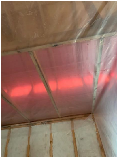
Vapour Barrier Install in Stairwell No. 3 For Mock-up