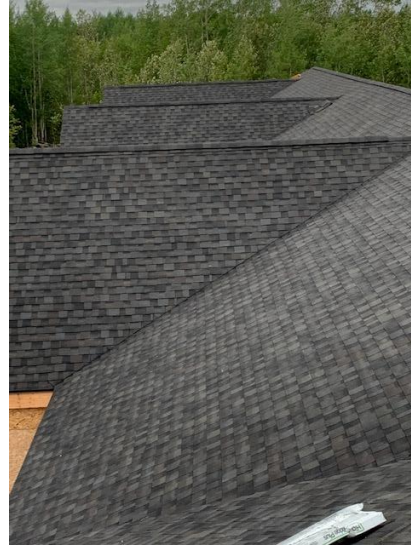
Roofing Shingles Install – West Wing