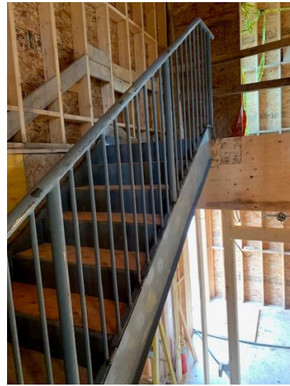
Handrail Install on Stair No. 2