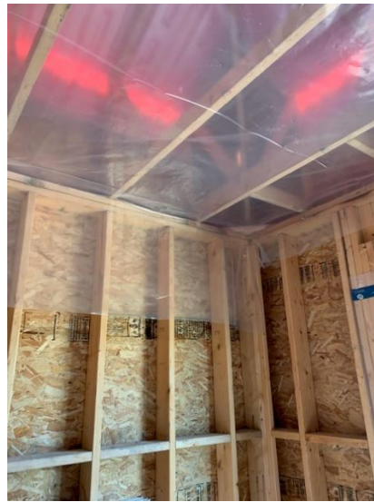
Vapour Barrier Installation on Second Floor Suite Ceiling – West Wing