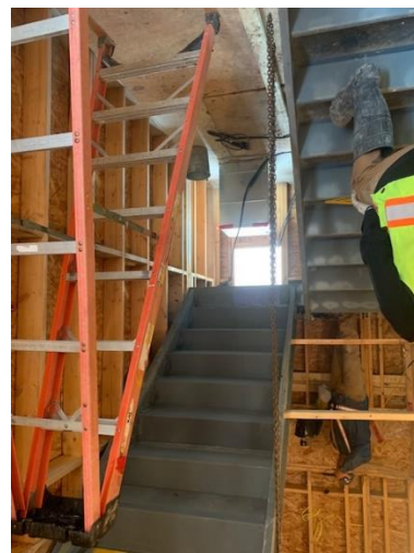
Steel Stair No. 2 Installation