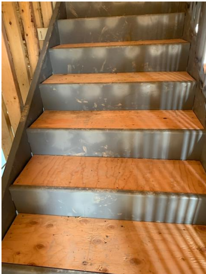
Temporary Steps Install on Stair No. 2