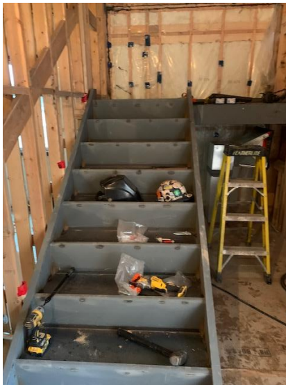
Steel Stair No. 3 Installation