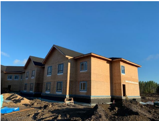
Exterior View – South East Wing