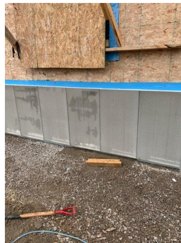
CFI Panels Installation on Grade Beam-South West Wing