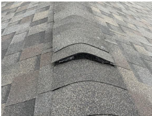
Roof Vent Install – West Wing