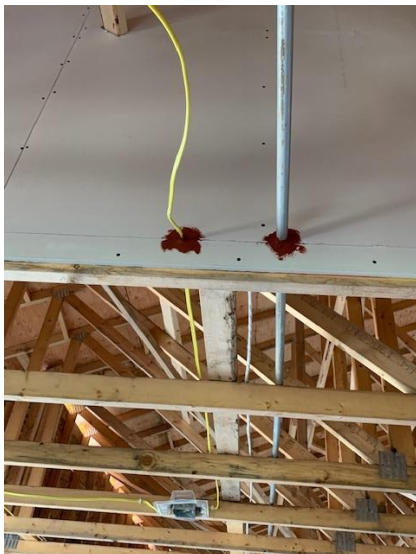
Fire Stopping Applied to Electrical Penetrations in Attic Compartment Wall – West Wing