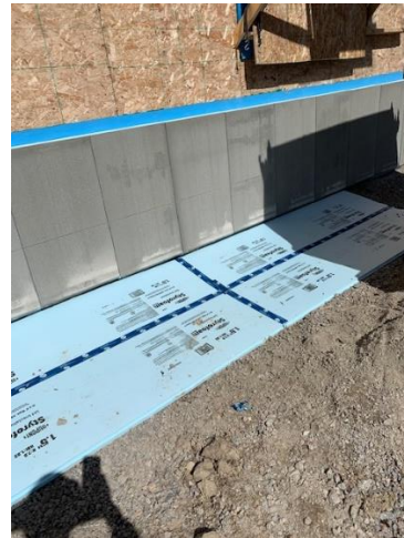
Below Grade Insulation Installation