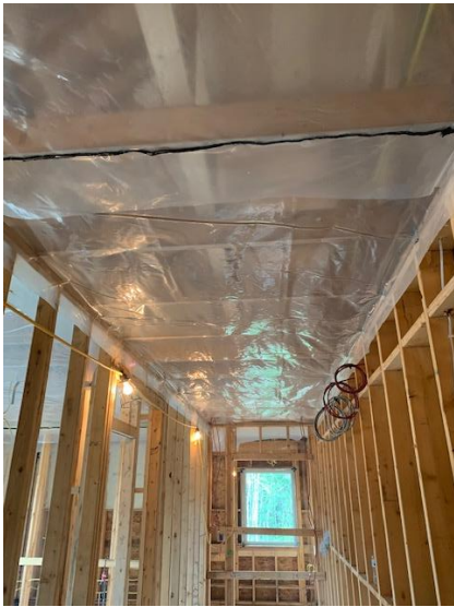
Vapour Barrier Installation on Second Floor Corridor Ceiling – West Wing