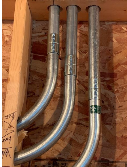
Electrical Conduit Install at Panel on Main Floor – East Wing