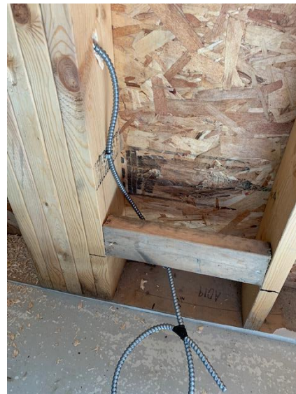
Electrical Wiring Pull on Main Floor – East Wing