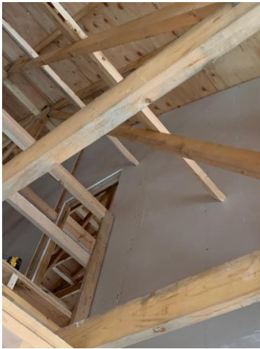
Attic Fire Compartment Wall Installation