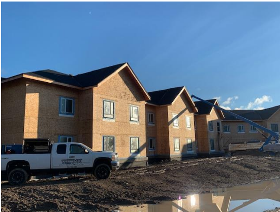
Exterior View – South West Wing