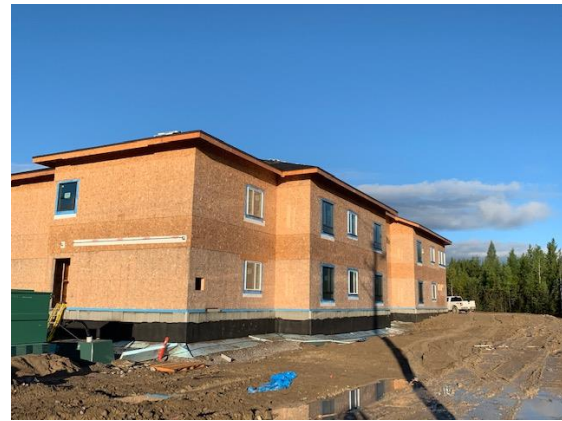
Exterior View – North East Wing