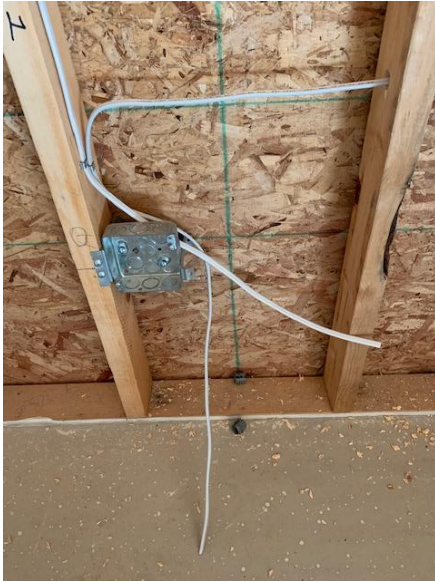
Electrical Wiring and Box Install on Main Floor – East Wing