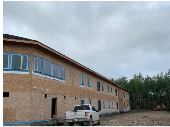
Exterior View – North West Wing