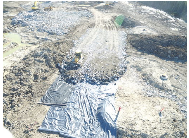
Site access road preparations