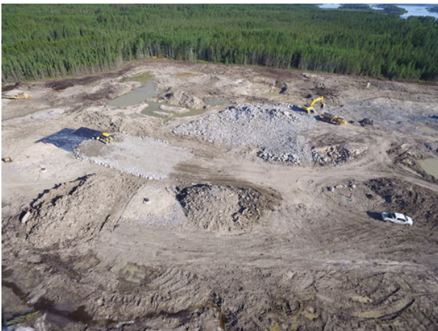
Site access road preparations