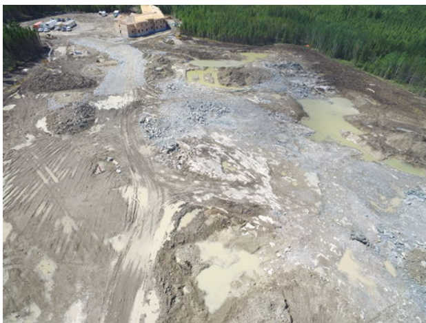
Preparation for dewatering due to heavy rainfall