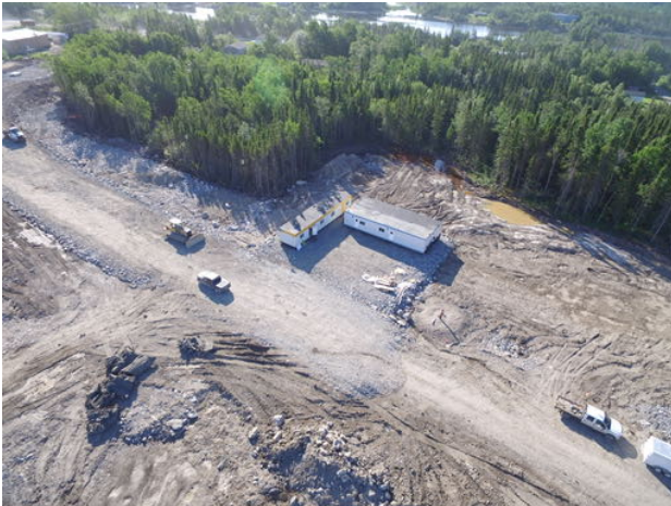
Drone shot of site office setup