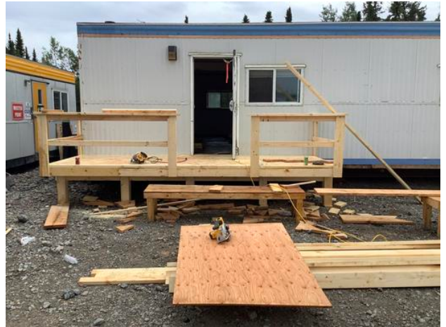
Deck framing in progress