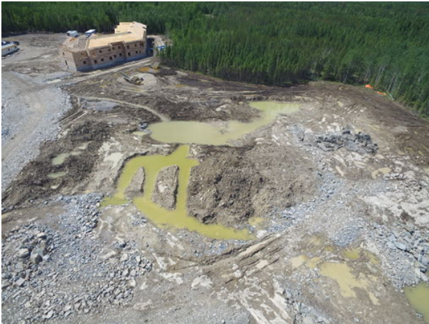
Preparation for dewatering due to heavy rainfall