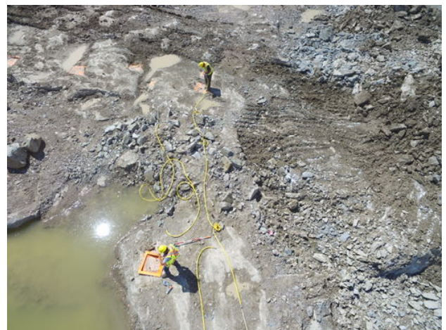
Drilling for pad locations