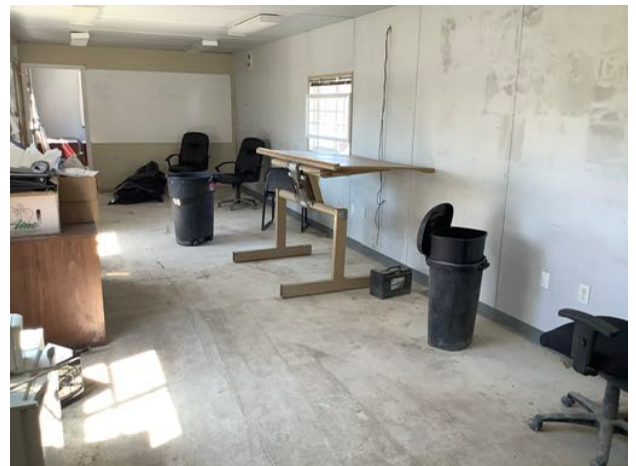
Site trailer interior finishing David Somerville Jul 7, 2020 5:29 PM