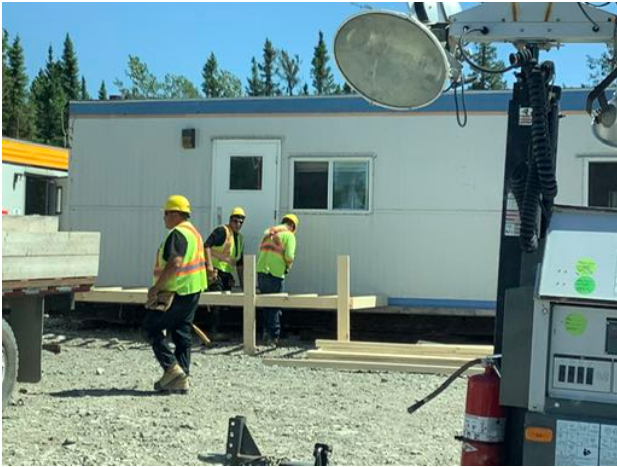
Site trailer deck framing