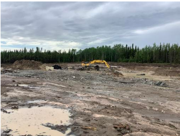
Excavation post blasting