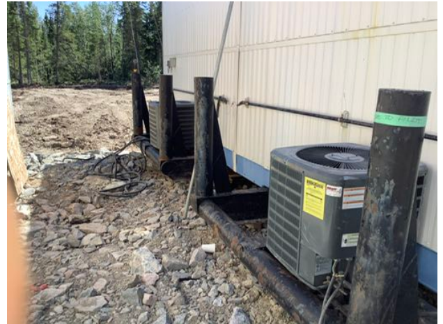
Temp mechanical/electrical at trailers David Somerville Jul 7, 2020 5:29 PM