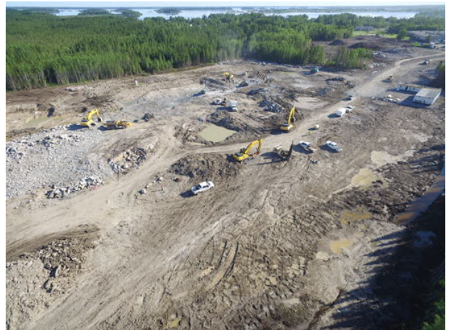
Excavation post blasting