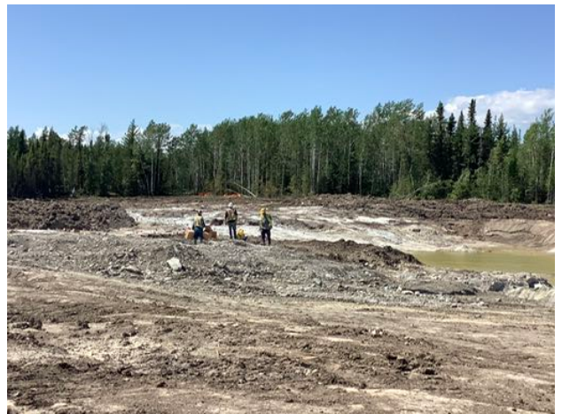
Drilling for blast charges