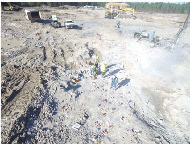
Drilling for blast charges