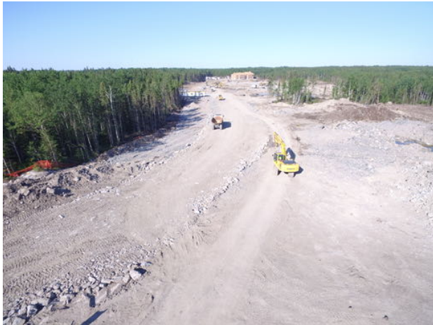
Site access road preparations