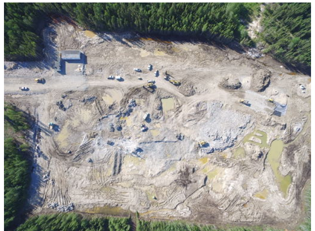
Drone shot of excavated areas