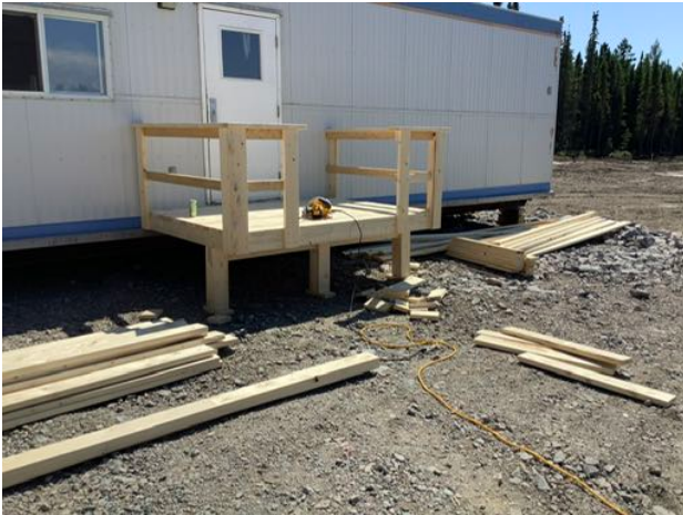
Site trailer deck framing David Somerville Jul 7, 2020 5:29 PM