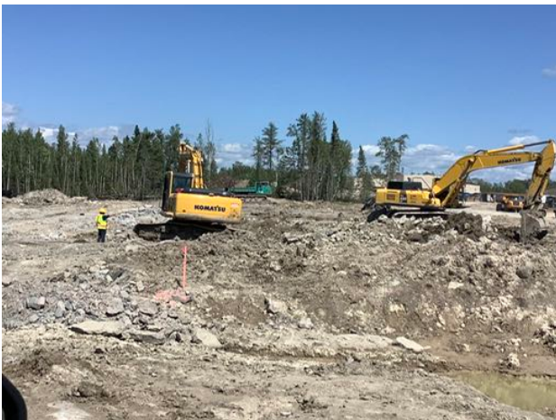
Excavation post blasting David Somerville Jul 7, 2020 5:29 PM