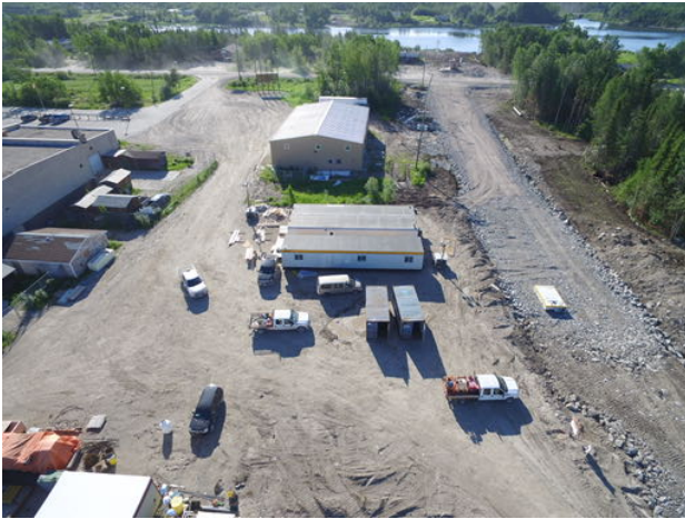
Drone shot of site office setup