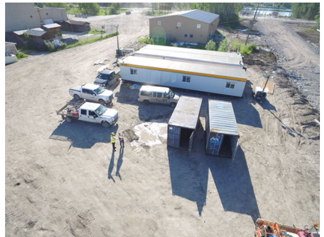
Drone shot of site trailer setup