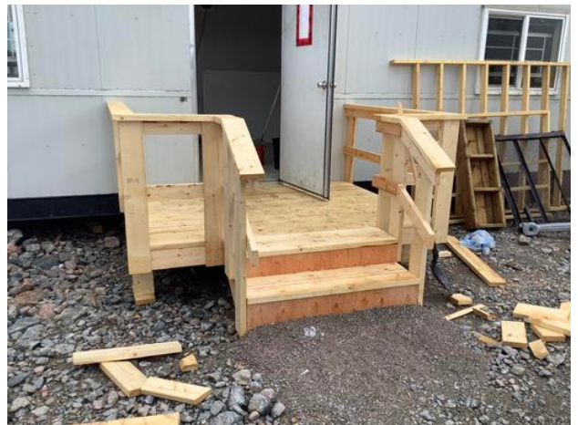
Deck framing in progress