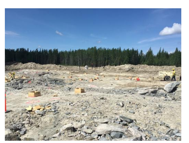
Footing formwork at various locations Hooman Kazempour Jul 22, 2020 1:11 PM