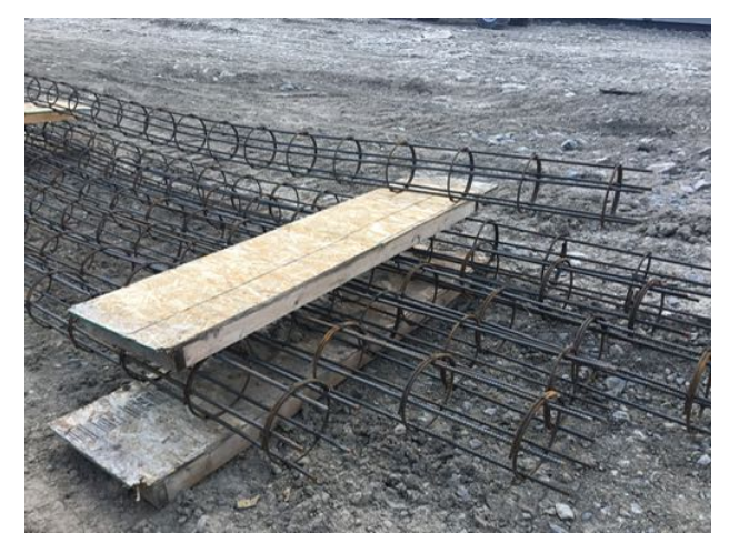
Completed rebar cages Hooman Kazempour Jul 22, 2020 1:57 PM