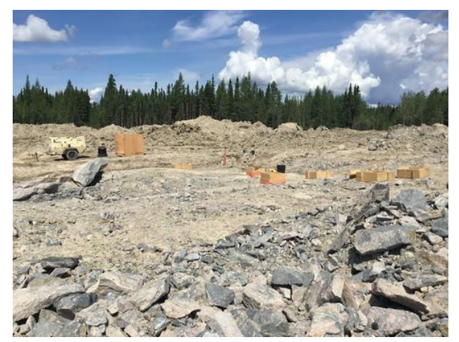
Footing formwork Hooman Kazempour Jul 22, 2020 1:10 PM