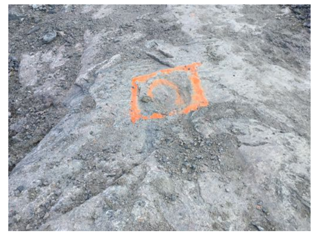
Footing location marked out Hooman Kazempour Jul 22, 2020 1:12 PM