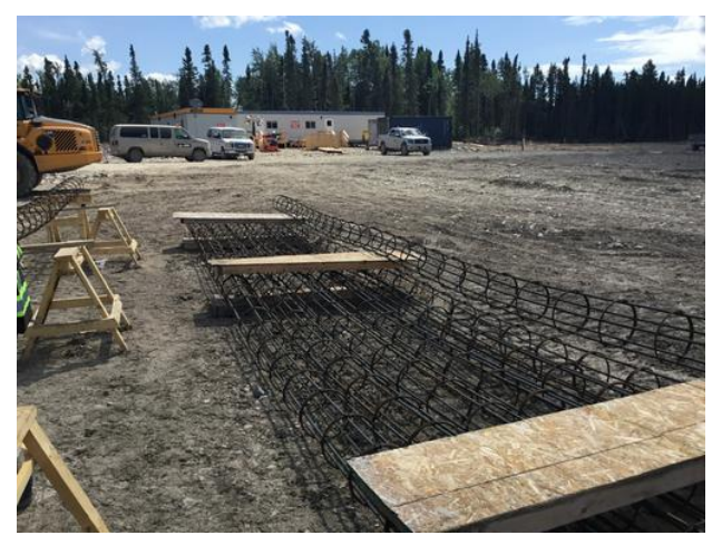
Completed rebar cages Hooman Kazempour Jul 22, 2020 1:57 PM