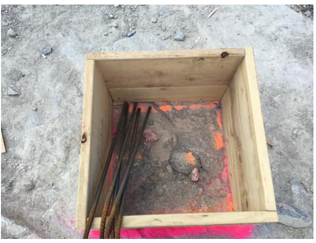
Footing location closeup Hooman Kazempour Jul 22, 2020 1:12 PM