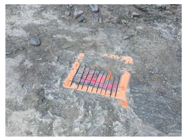
Footing location to be chipped Hooman Kazempour Jul 22, 2020 1:11 PM