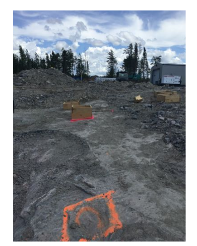
View of various footings Hooman Kazempour Jul 22, 2020 1:12 PM