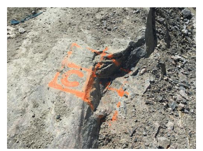
Footing location to be chipped Hooman Kazempour Jul 22, 2020 1:41 PM