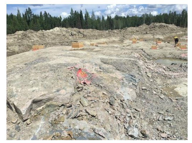
Footings being formed Hooman Kazempour Jul 22, 2020 1:37 PM