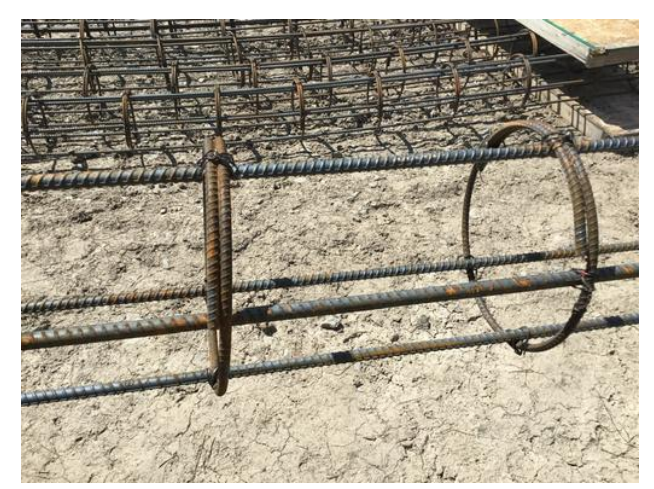
Rebar closeup Hooman Kazempour Jul 22, 2020 1:58 PM