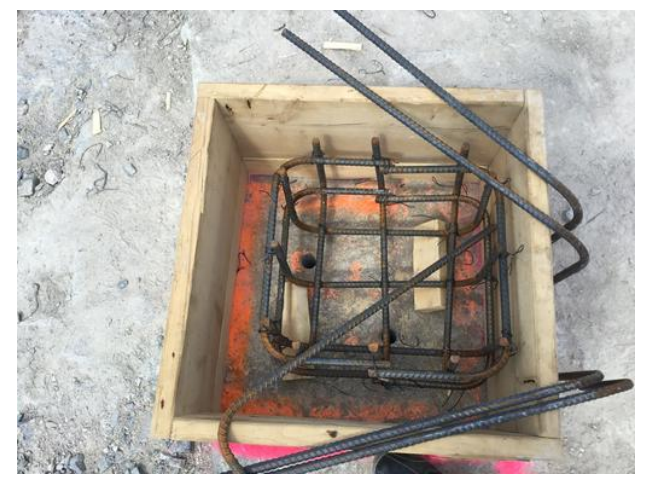
Rebar being placed in footing form work Hooman Kazempour Jul 22, 2020 1:13 PM