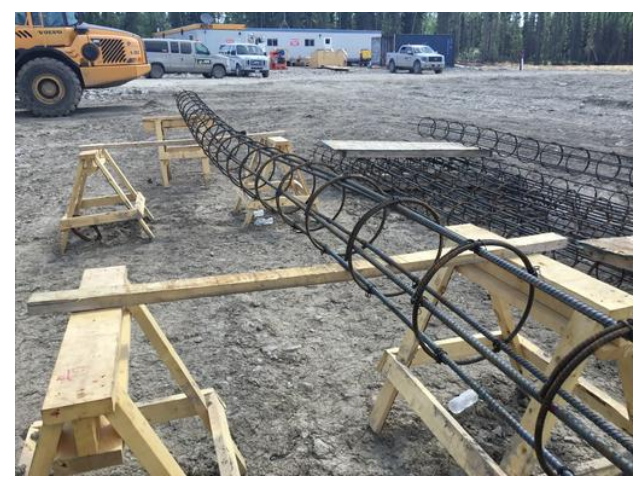
Rebar cages being tied Hooman Kazempour Jul 22, 2020 1:57 PM