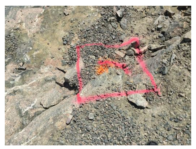
20200722_133656_photo Hooman Kazempour Jul 22, 2020 1:36 PM