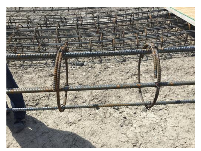
Rebar closeup Hooman Kazempour Jul 22, 2020 1:58 PM