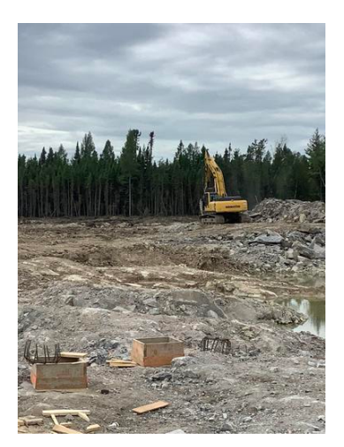
IMG_0163 David Somerville Aug 19, 2020 7:08 AM