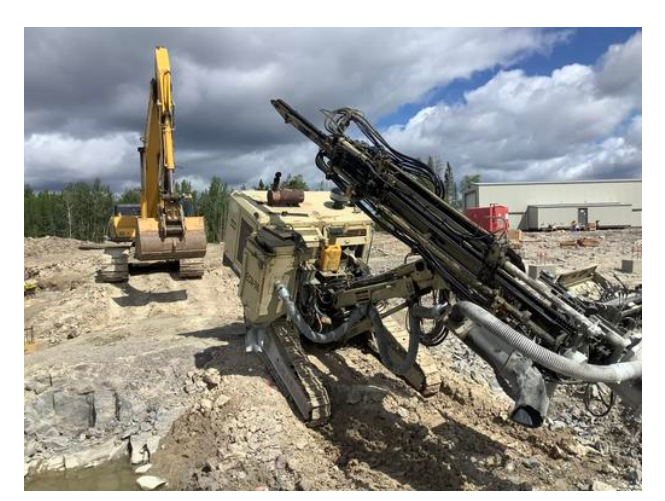
IMG_0145 David Somerville Aug 19, 2020 7:08 AM