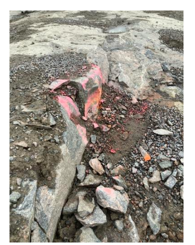
IMG_0136 David Somerville Aug 19, 2020 7:08 AM