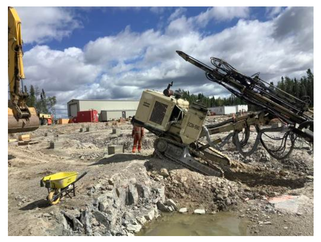
IMG_0144 David Somerville Aug 19, 2020 7:08 AM