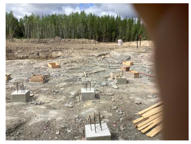
IMG_0152 David Somerville Aug 19, 2020 7:08 AM