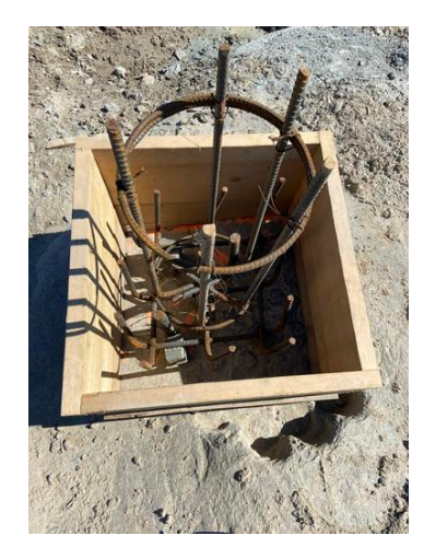
tied rebar Wayne Dee Aug 19, 2020 6:40 AM

Rock drill and operator Wayne Dee Aug 19, 2020 6:40 AM