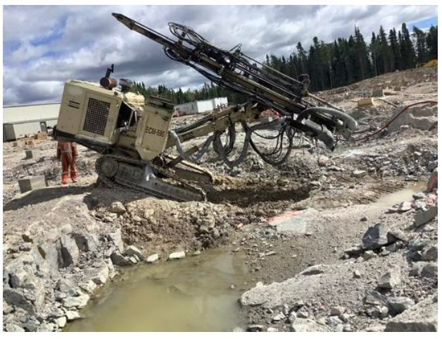
IMG_0142 David Somerville Aug 19, 2020 7:08 AM