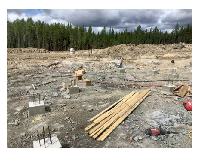
IMG_0153 David Somerville Aug 19, 2020 7:08 AM