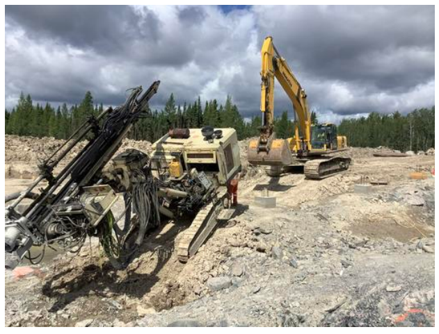
IMG_0146 David Somerville Aug 19, 2020 7:08 AM