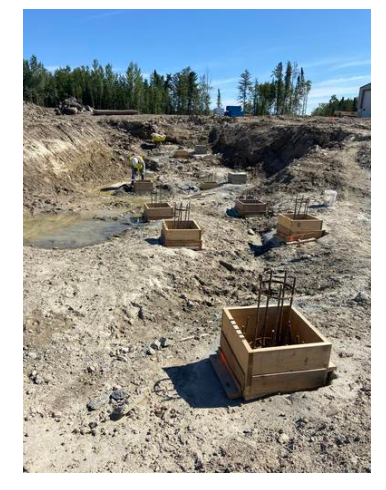
IMG_0200 Wayne Dee Aug 19, 2020 6:40 AM