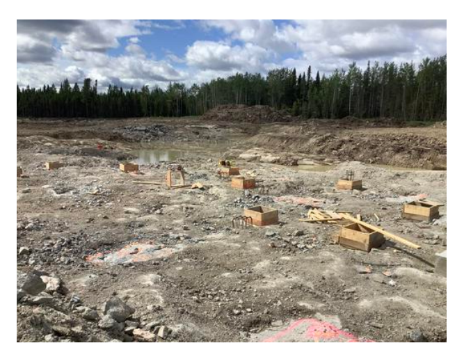
IMG_0156 David Somerville Aug 19, 2020 7:08 AM