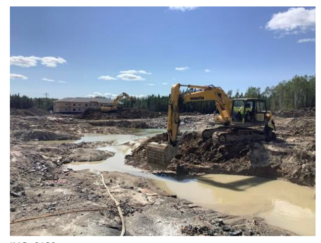
IMG_0126 David Somerville Aug 19, 2020 7:08 AM