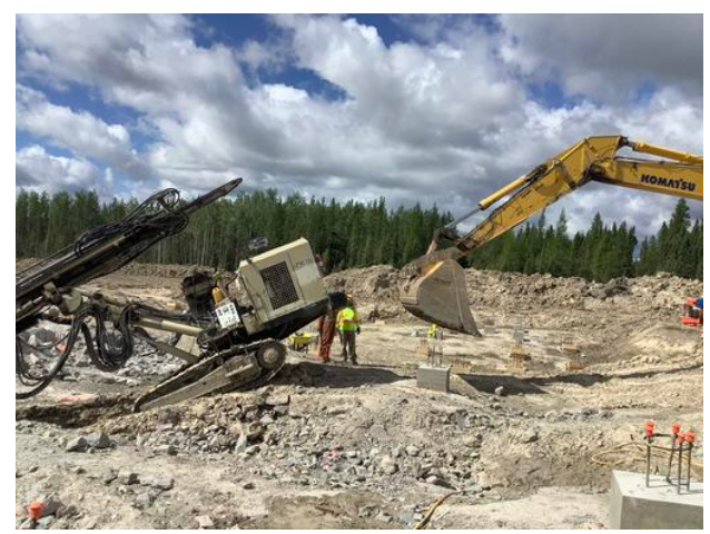
IMG_0149 David Somerville Aug 19, 2020 7:08 AM