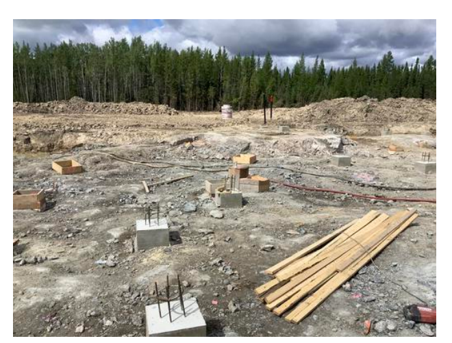
IMG_0154 David Somerville Aug 19, 2020 7:08 AM