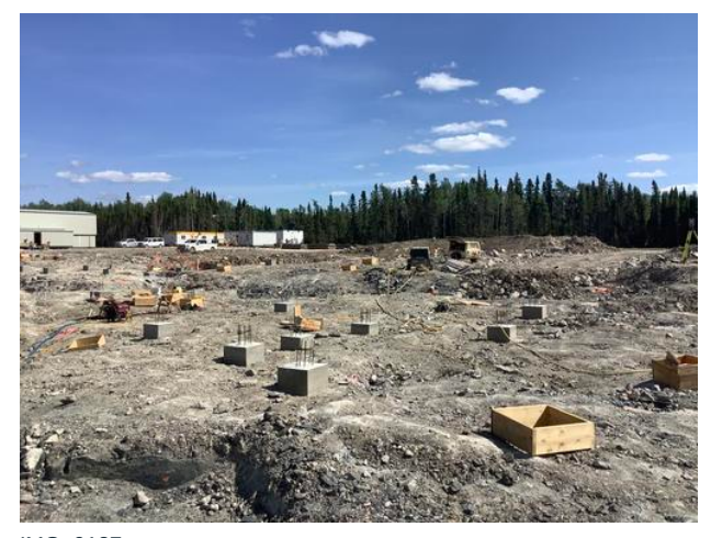
IMG_0127 David Somerville Aug 19, 2020 7:08 AM

IMG_0123 David Somerville Aug 19, 2020 7:08 AM