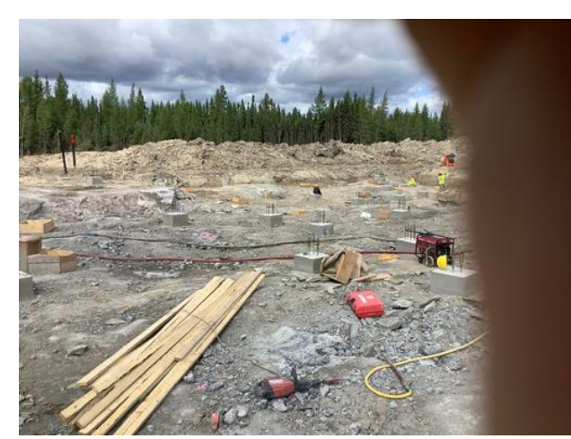
IMG_0151 David Somerville Aug 19, 2020 7:08 AM