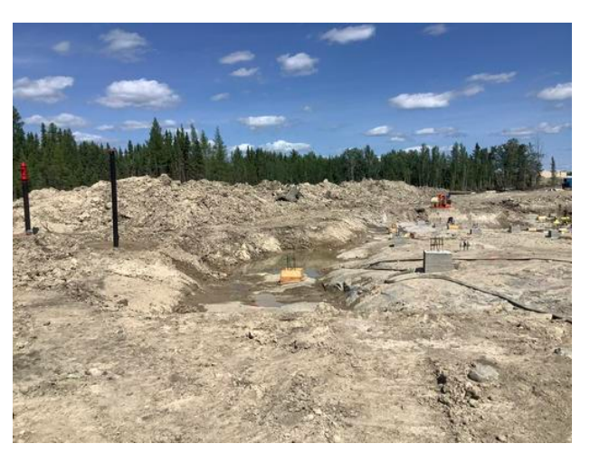
IMG_0124 David Somerville Aug 19, 2020 7:08 AM