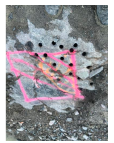
IMG_0134 David Somerville Aug 19, 2020 7:08 AM