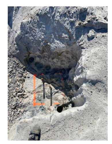
IMG_0203 Wayne Dee Aug 19, 2020 6:40 AM

IMG_0168 David Somerville Aug 19, 2020 7:08 AM