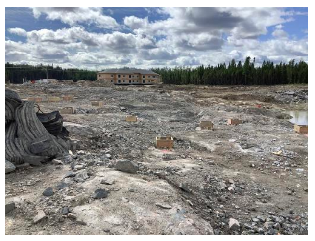
IMG_0158 David Somerville Aug 19, 2020 7:08 AM