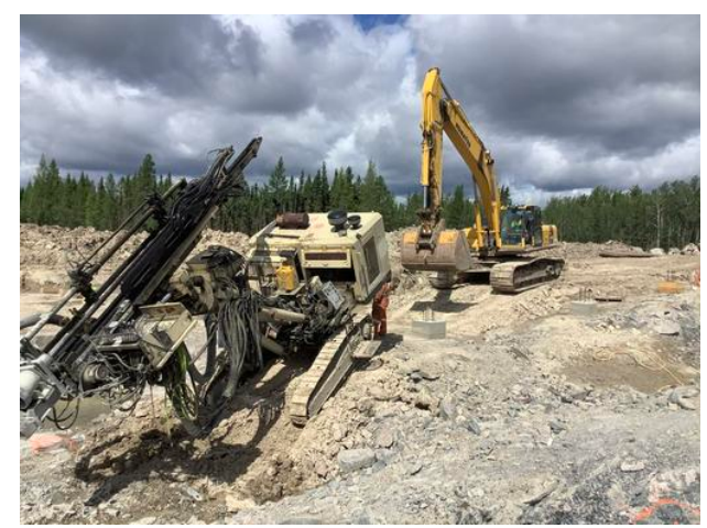
IMG_0147 David Somerville Aug 19, 2020 7:08 AM