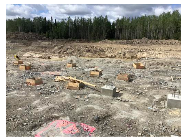
IMG_0155 David Somerville Aug 19, 2020 7:08 AM