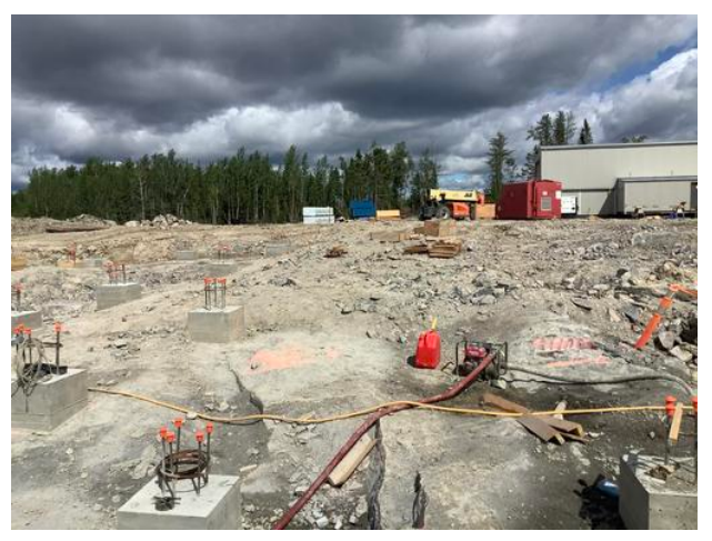
IMG_0148 David Somerville Aug 19, 2020 7:08 AM