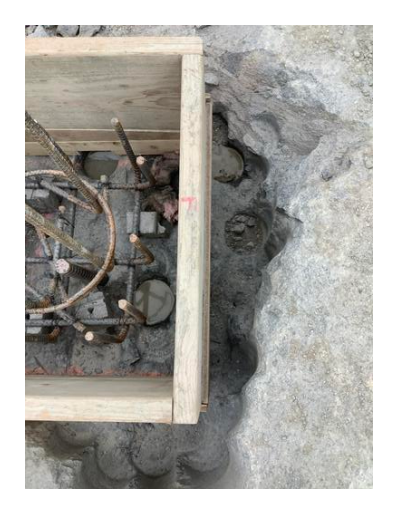
IMG_0167 David Somerville Aug 19, 2020 7:08 AM