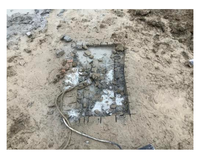
IMG_0130 David Somerville Aug 19, 2020 7:08 AM