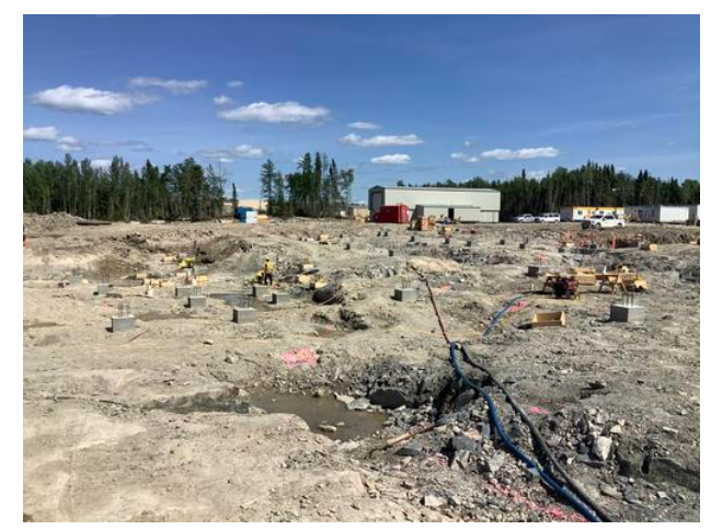
IMG_0129 David Somerville Aug 19, 2020 7:08 AM