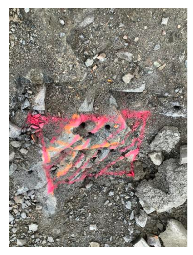
IMG_0135 David Somerville Aug 19, 2020 7:08 AM