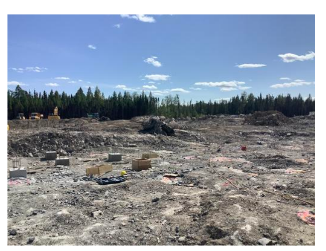
IMG_0128 David Somerville Aug 19, 2020 7:08 AM