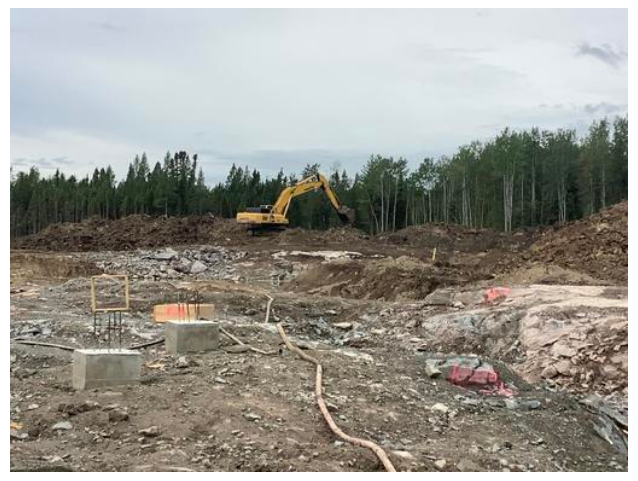
IMG_0139 David Somerville Aug 19, 2020 7:08 AM