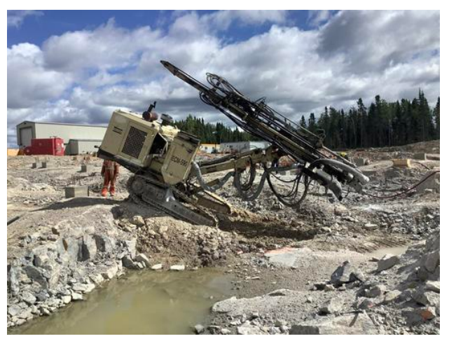
IMG_0141 David Somerville Aug 19, 2020 7:08 AM