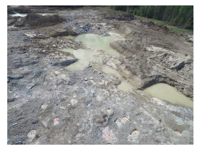
IMG_0116 Wayne Dee Aug 12, 2020 2:29 PM