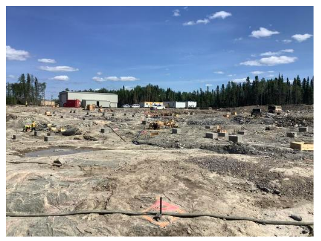
IMG_0125 David Somerville Aug 19, 2020 7:08 AM