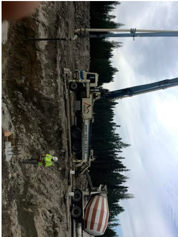
Concrete pump line_20200821_123100