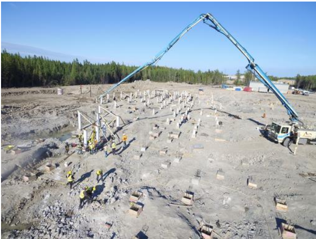
pump boom on site