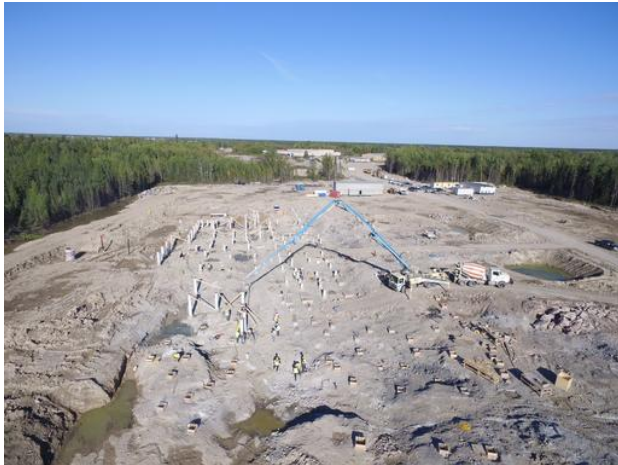
Pump truck pouring piers