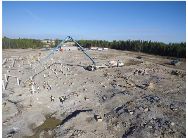
pump truck pouring piers