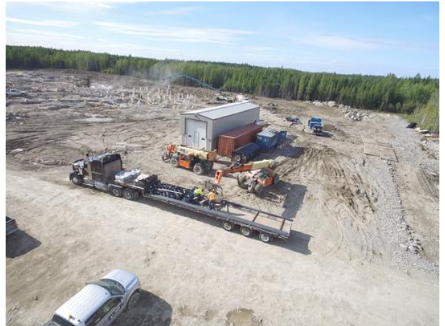
materials being unloaded