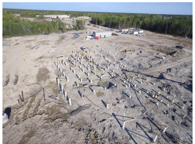
piers and pads area A1