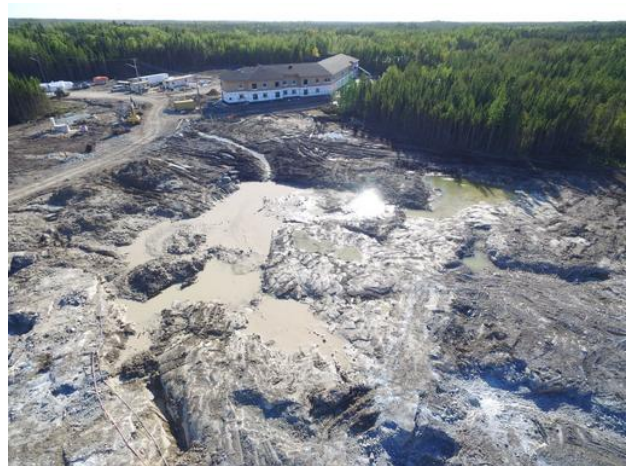
area to be dewatered after rains