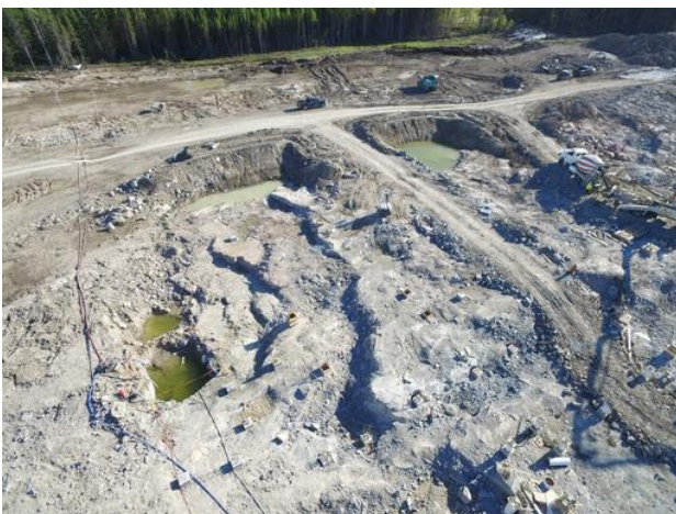
drone shot of pad locations