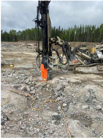
Rock dill chipping