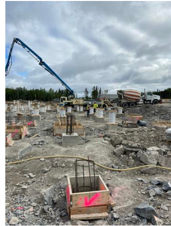
pier and pad locations