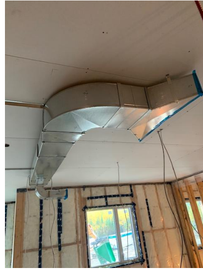
Duct Work Installation on Second Floor Suite Ceilings - West Wing