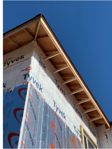
Soffit Framing – South West Wing