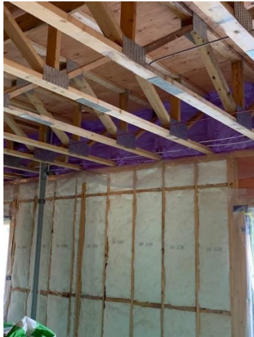
Spray Foam Insulation Applied to Cavities Between Second Floor Trusses - West Wing