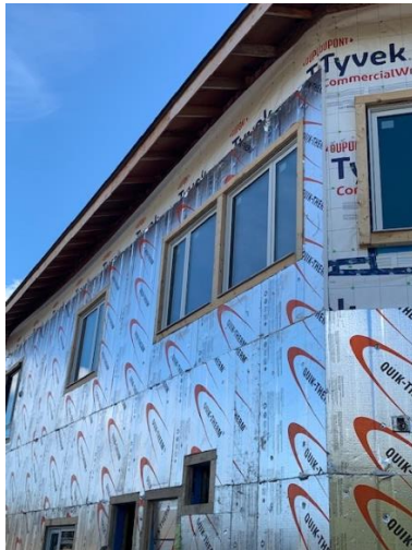
Exterior Rigid Insulation Install – North East Wing