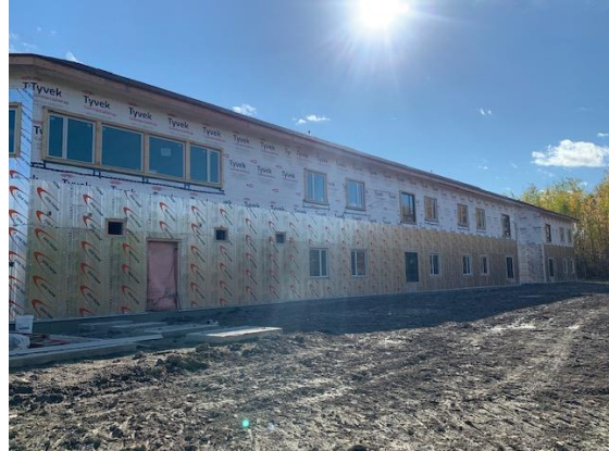
Exterior View – North West Wing