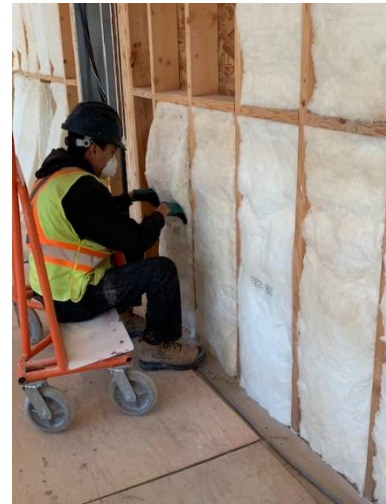
Batt Insulation Install on Second Floor Corridor Wall - South East Wing