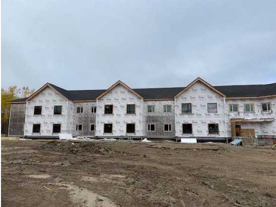
Exterior View – South West Wing