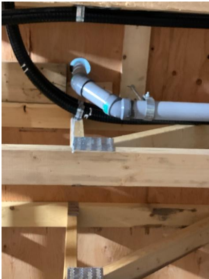
Plumbing Sanitary Line Install to Second Floor – West Wing