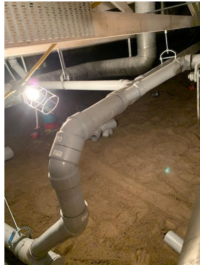
Plumbing Sanitary Line Install in Crawlspace – East Wing