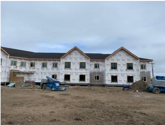
Exterior View – South East Wing