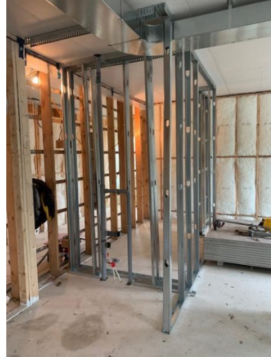
Steel Stud Install in Second Floor Suites – East Wing