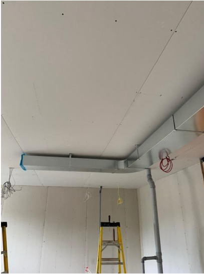
Duct Work Installation on Second Floor Suite Ceilings – East Wing