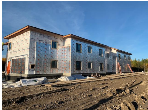
Exterior View – North East Wing