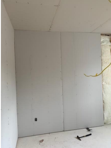
Gypsum Board Install in Second Floor Suites – West Wing