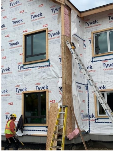
Wing Wall Construction – West Wing