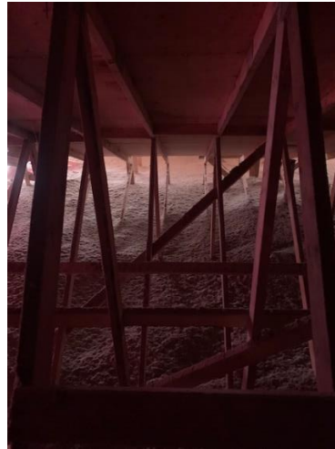
Blown-in Insulation in Attic – East Wing