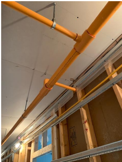
Sprinkler Line Install in Corridor on Second Floor – West Wing