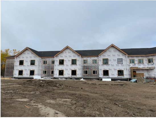
Exterior View – South West Wing