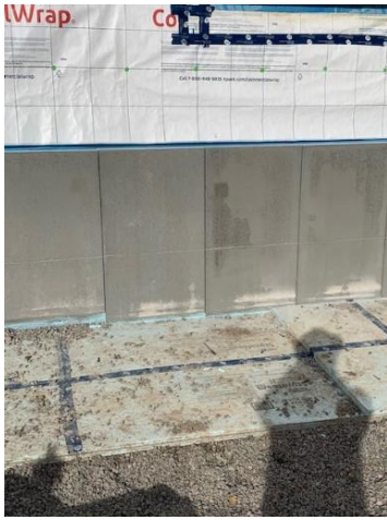
CFI Panels Install on Grade Beam – South East Wing