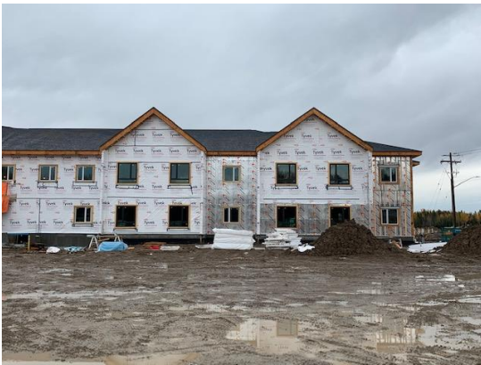
Exterior View – South East Wing