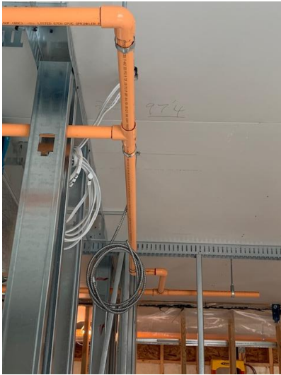
Sprinkler Line Install in Second Floor Suite – East Wing