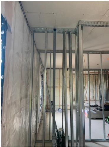
Steel Stud Install in Second Floor Suites – West Wing