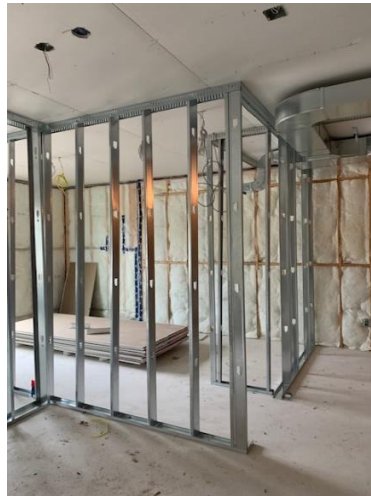
Steel Stud Install in Second Floor Suites – East Wing