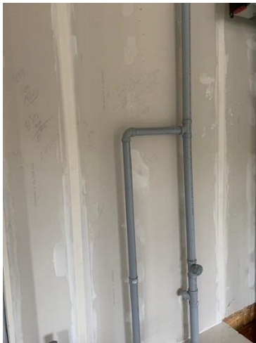
Apply Drywall Tape and Mud to Gypsum Board - West Wing