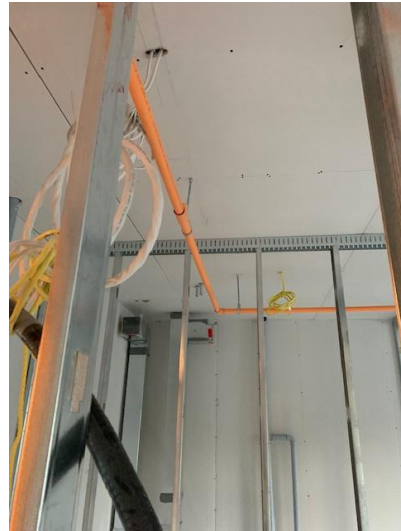
Sprinkler Line Install in Second Floor Suite – West Wing