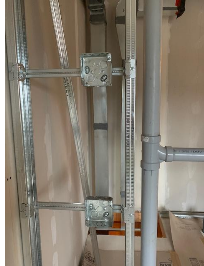
Electrical Box Install in Second Floor Suite – West Wing