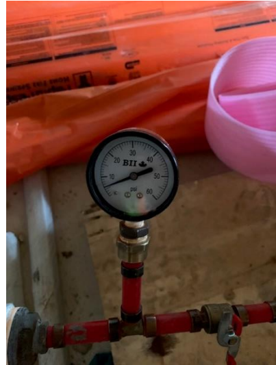
Sanitary Line Test No. 2 – East Wing