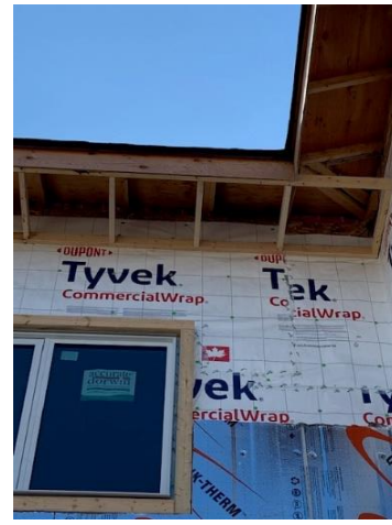
Soffit Framing – East End