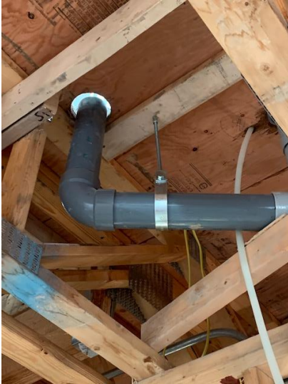
Sanitary Line Install to Second Floor - West Wing