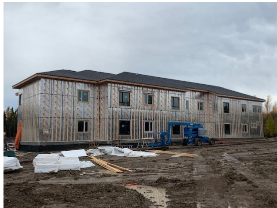
Exterior View – North East Wing