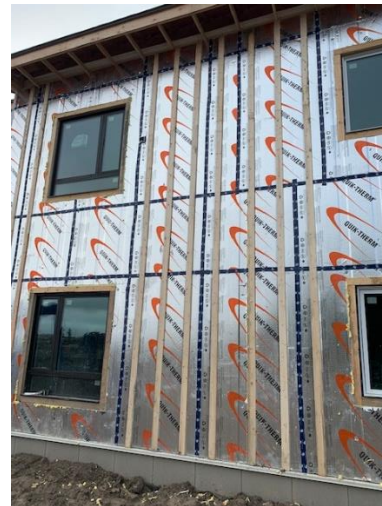
Strapping Install on Exterior Wall - North East Wing