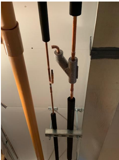
Refrigeration Line Install in Second Floor Corridor – West Wing