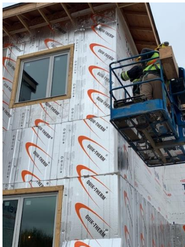
Exterior Rigid Insulation Install – East End