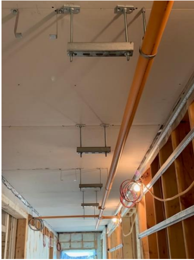
Hangers Install for Refrigeration Lines on Second Floor Corridor Ceiling – East Wing