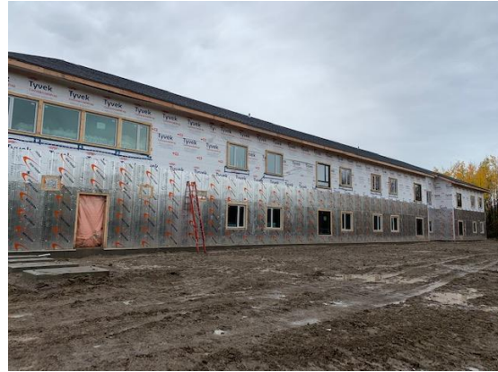
Exterior View – North West Wing