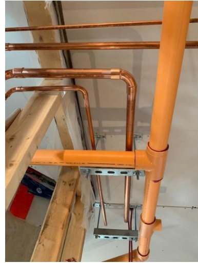
Refrigeration Lines Install in Second Floor Corridor – East Wing