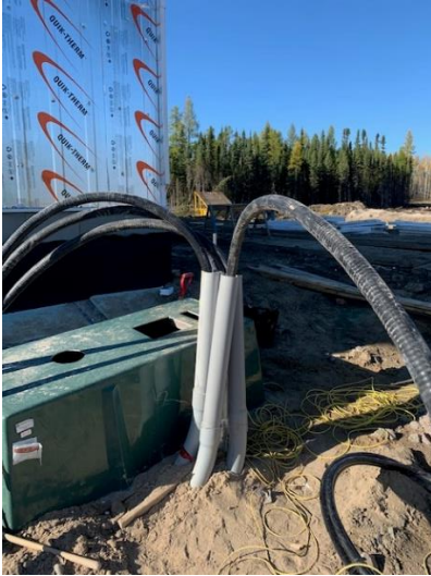
Electrical Cable Pull from Electrical Electrical Room to CSTE