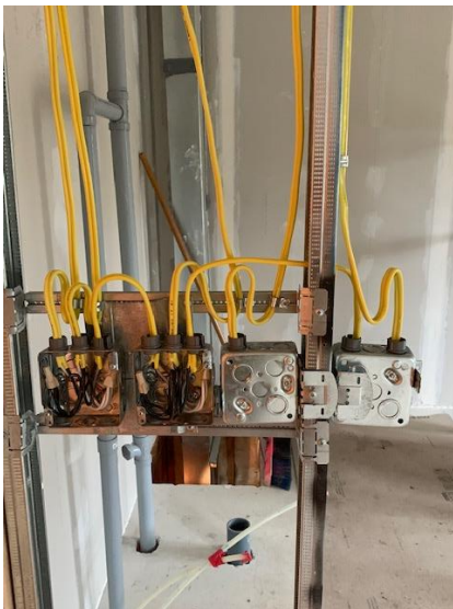
Electrical Box and Wiring Install in Second Floor Suite – West Wing