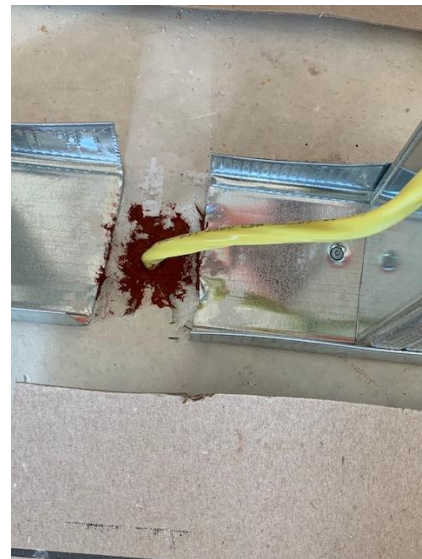
Firestopping Sealant Applied to Electrical Penetration on Second Floor – West Wing