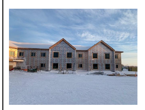
Exterior View – South East Wing