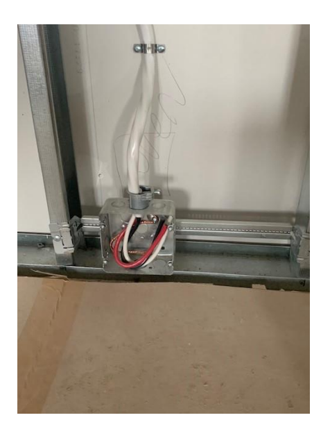
Electrical Box and Wiring Install in Second Floor Suite – West Wing