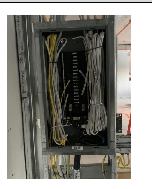
Electrical Wiring in Panel on Second Floor Suite – West Wing