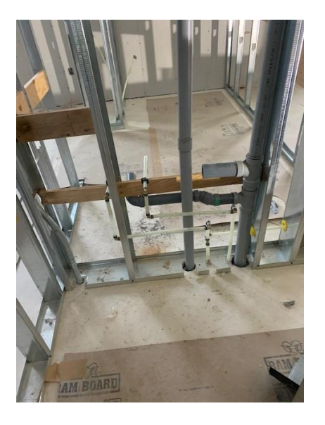
Domestic Water Line Install on Second Floor – West Wing