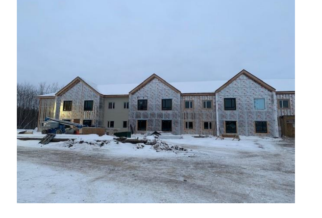
Exterior View – South West Wing