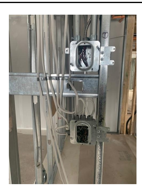
Electrical Box and Wiring Install in Second Floor Suite – East Wing