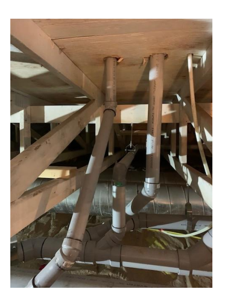
Sanitary Lines Install in Crawlspace - West Wing