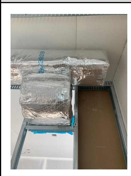
Ductwork Insulation Install on Second Floor – West Wing