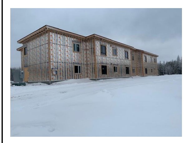
Exterior View – North East Wing