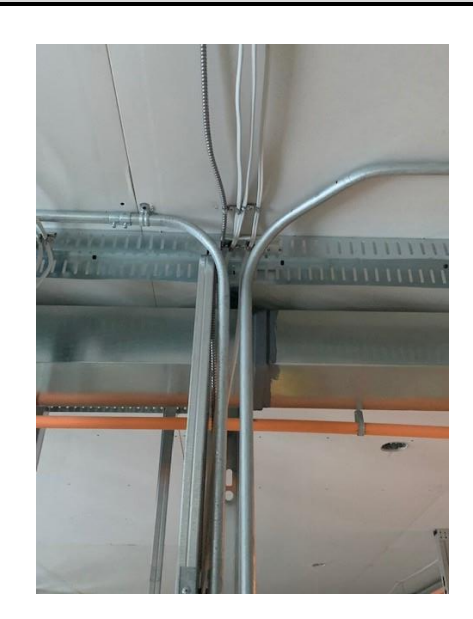
Electrical Conduit Install in Second Floor Suite – West Wing