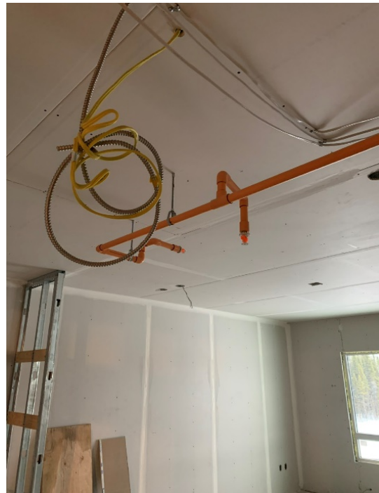
Sprinkler Rough In