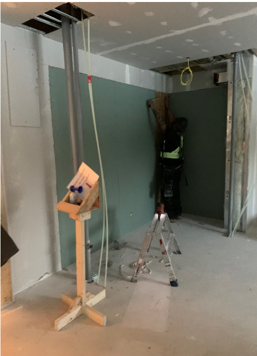
Mold Resistant Board