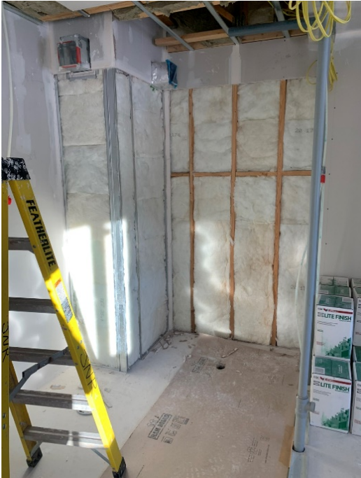
Mold Resistant Board