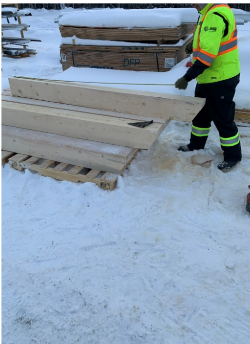
Parking Pedestal Prep