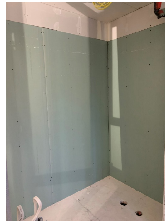
Mold Resistant Board