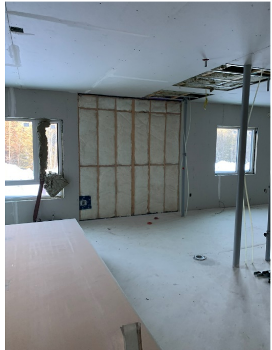
Mold Resistant Board