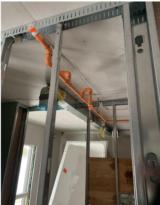
Sprinkler Rough in