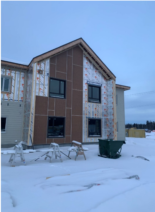
Fiber Cement Siding