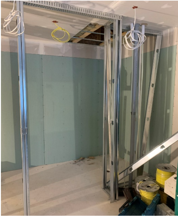
Mold Resistant Board