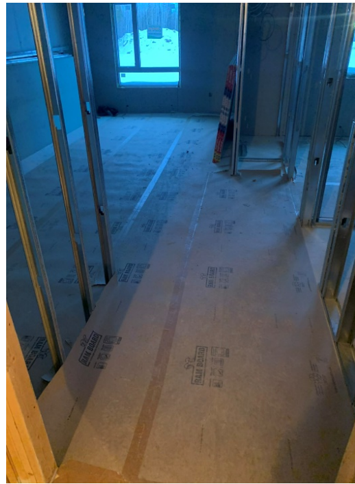
Ram Board Replacement