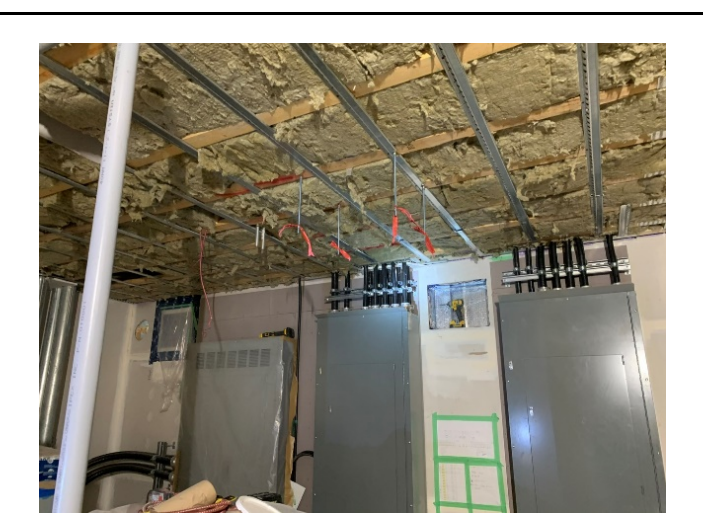
Insulation Above Electrical Room