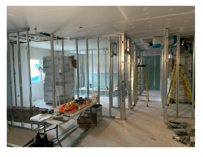
LVL 1 Steel Stud Framing