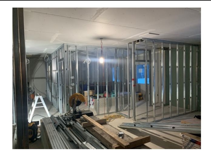
LVL 1 Steel Stud Framing