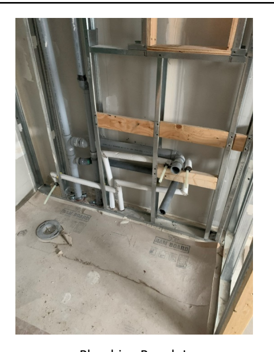
Plumbing Rough Ins