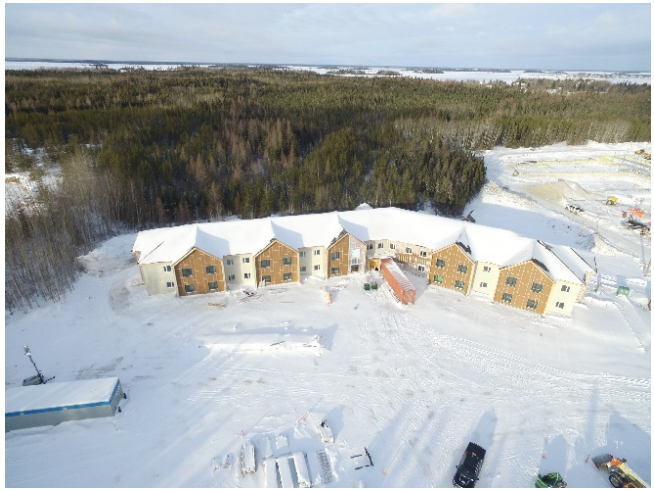
Fibre Cement Siding Install