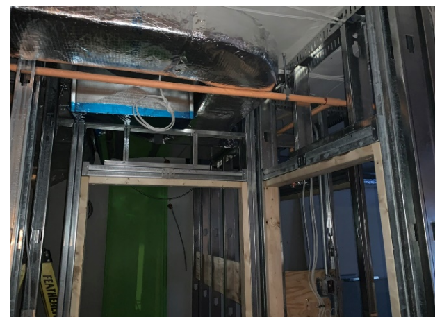
Door Blocking Door Blocking