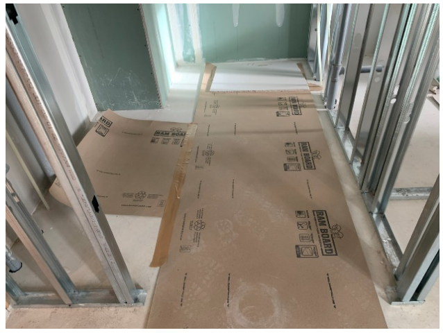
Ram Board Install/Replacement