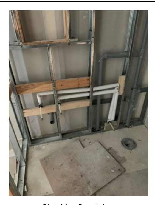
Plumbing Rough Ins