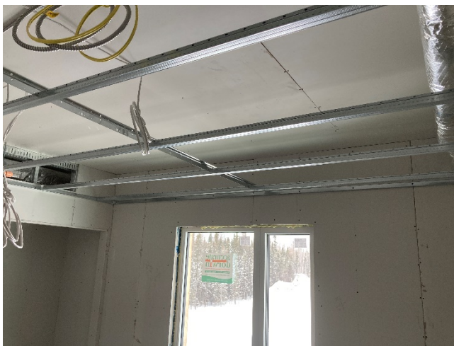
Ceiling Mock Up – LVL 2