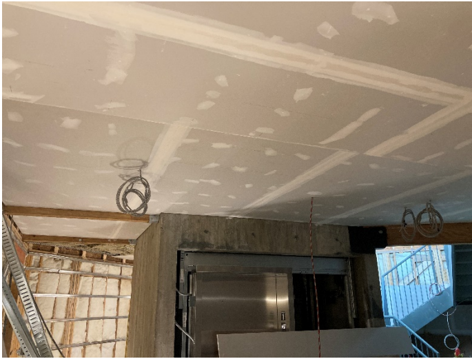
Gypsum Board Ceiling - Lobby