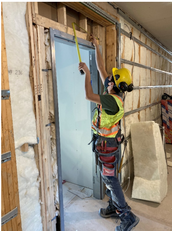
Acoustic Insulation Install – LVL 2