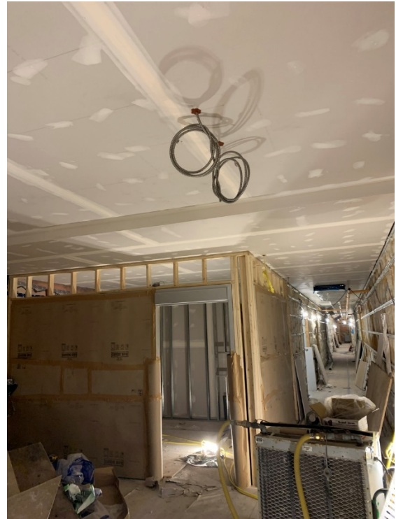
Gypsum Board Ceiling - Lobby