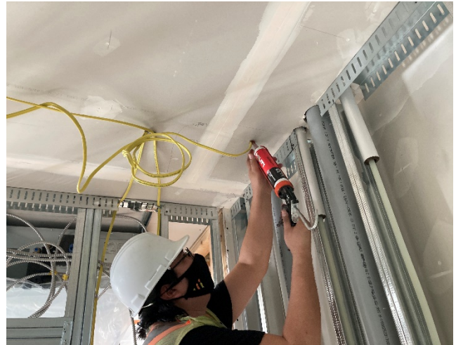
Electrical Firestopping – LVL 1