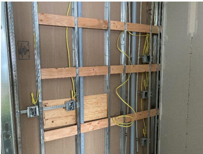
Plumbing/Electrical Rough Ins – LVL 1