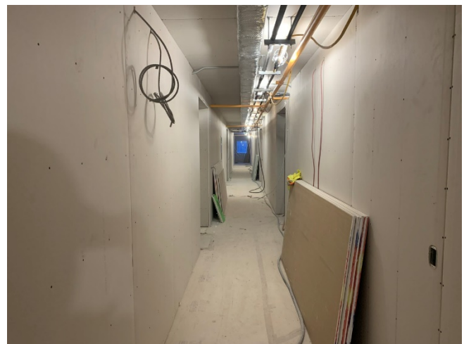
Gypsum Board Install – LVL 2 Hallway