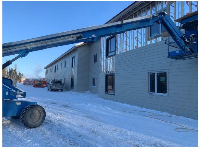
Fiber Cement Siding Install – South