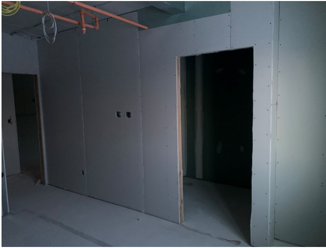
Gypsum Board Install – LVL 2