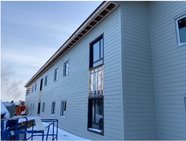
Fiber Cement Siding Install – South