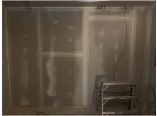
Taping – Main Vestibule