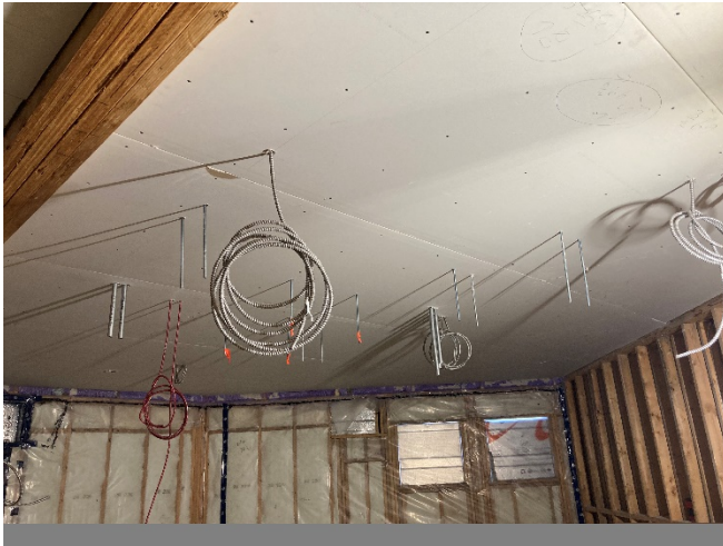
Gypsum Board Ceiling – LVL 1