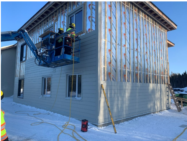
Fiber Cement Siding Install – South