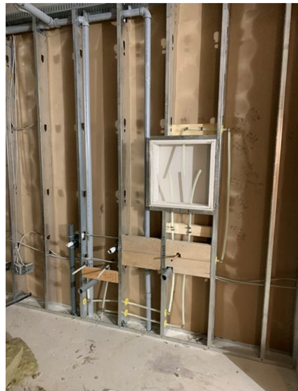
Plumbing Rough Ins – LVL 1