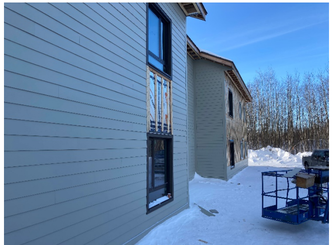
Fiber Cement Siding Install - South