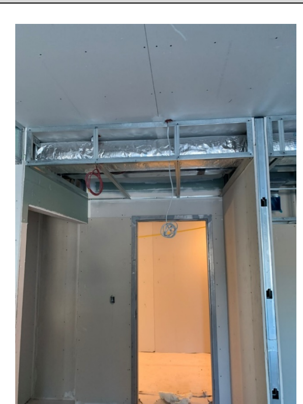
Ceiling Framing – LVL 1 East Wing