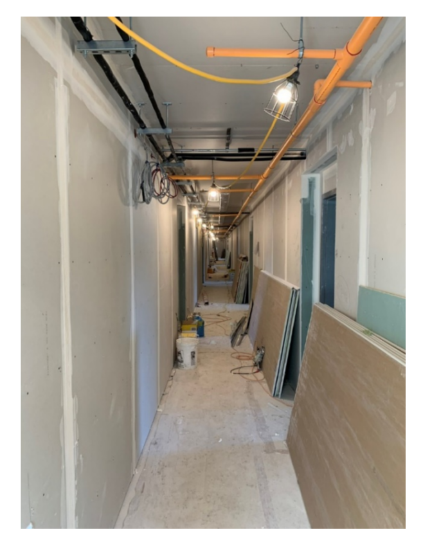
Hallway Progress – LVL 2