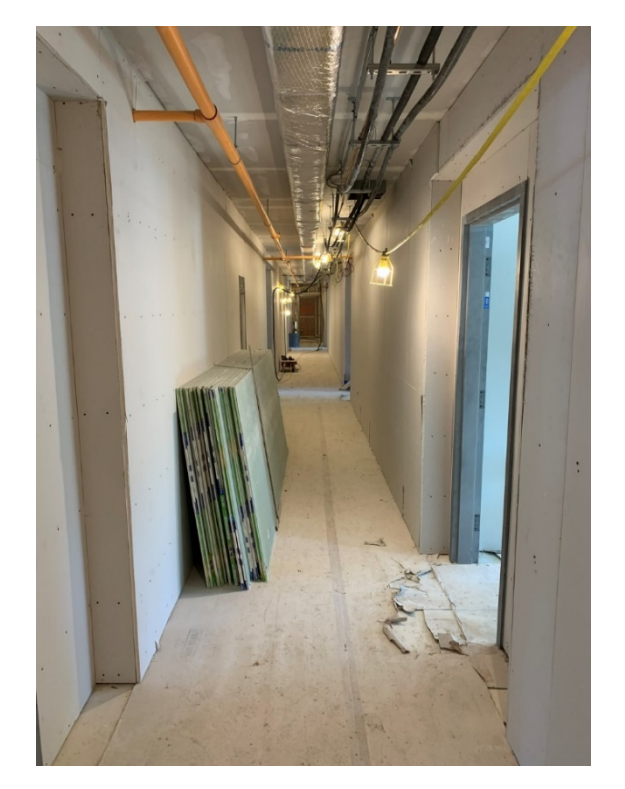
Hallway Progress – LVL 2