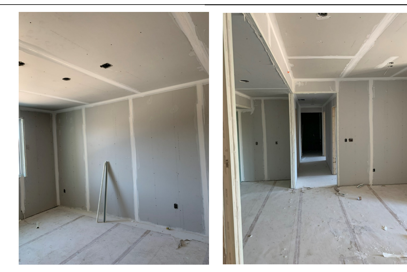
Taping Progress – LVL 2 West Wing