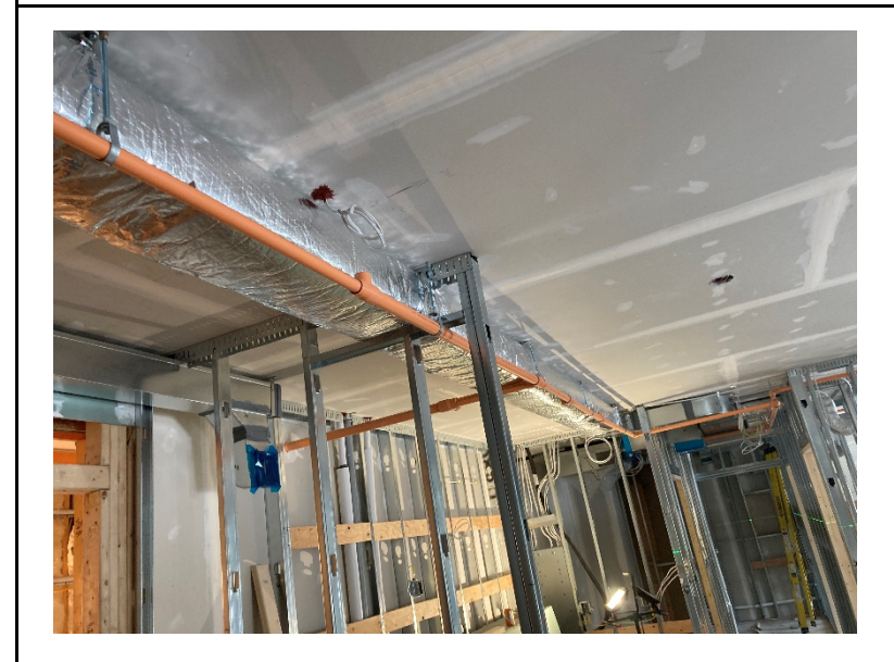
HVAC Installation – LVL 1