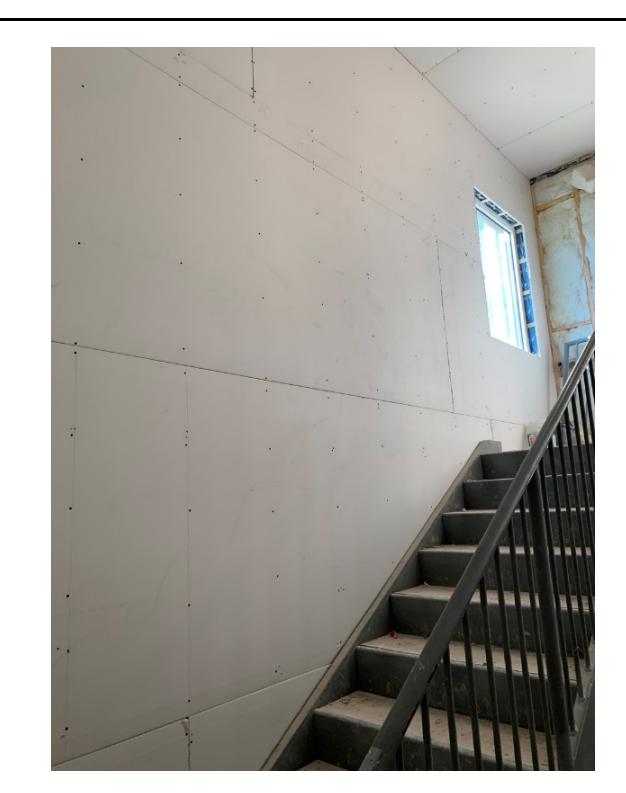
Gypsum Board – Stair # 2