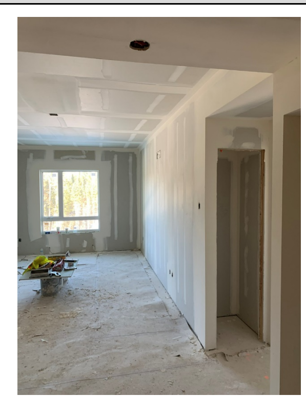
Taping Progress – LVL 2 East Wing