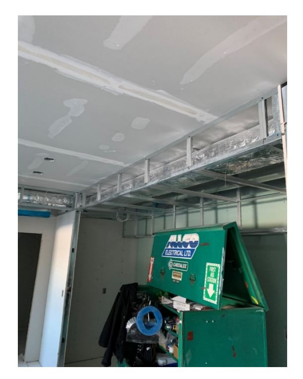
Ceiling Framing - LVL 1 East Wing