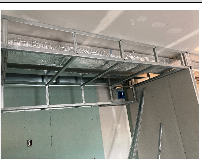
Bulkhead Framing – LVL 1