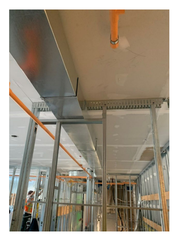
Duct Installation – LVL 1 West Wing