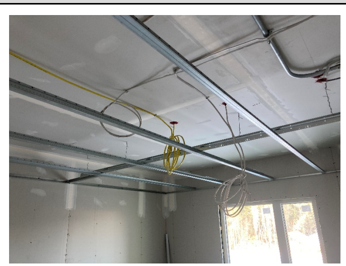
Suspended Ceiling – LVL 1