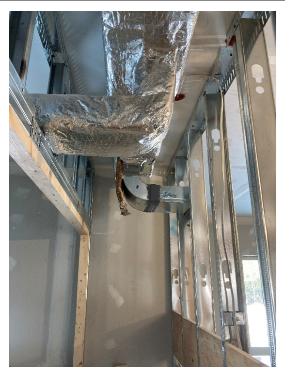
HVAC Installation – LVL 1