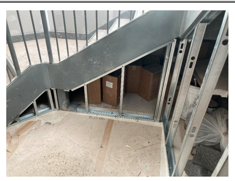
Steel Stud Framing – Stair # 1