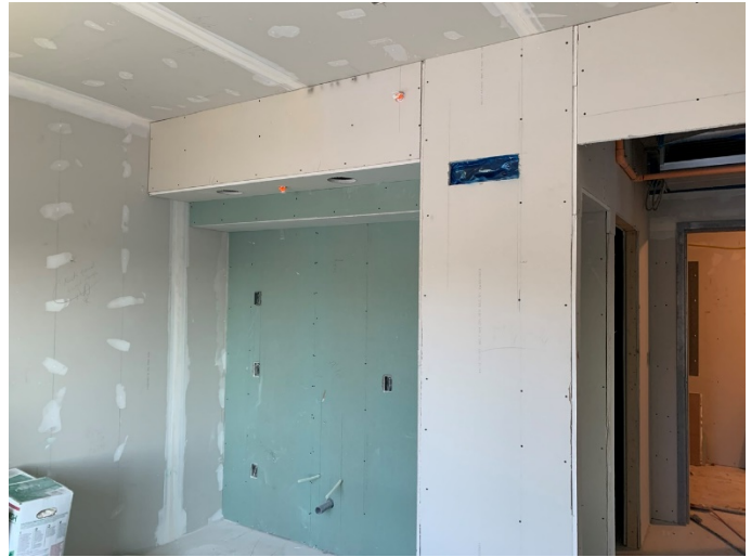
LVL 1 Wall/Ceiling Board