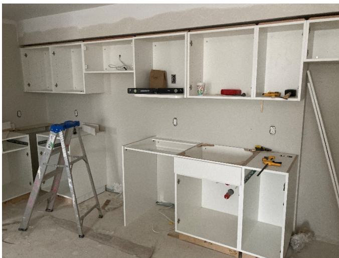
LVL 2 Millwork Mock-Up Suite Progress