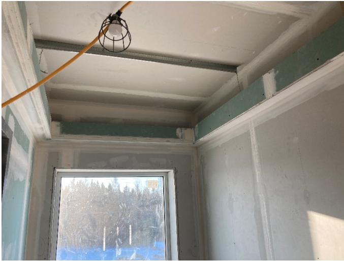
LVL 2 Corridor Bulkhead Progress