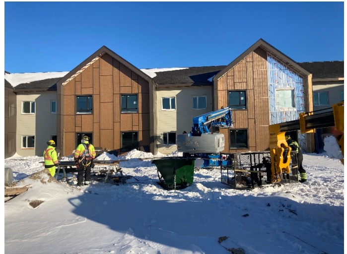
Exterior View – South