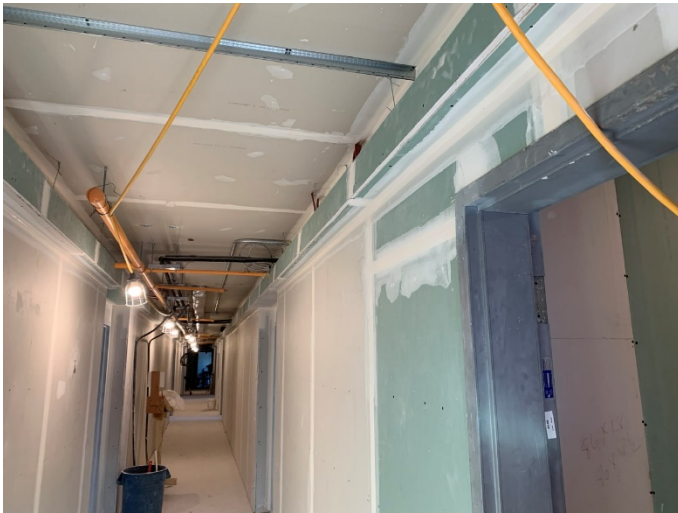
LVL 2 Corridor Progress