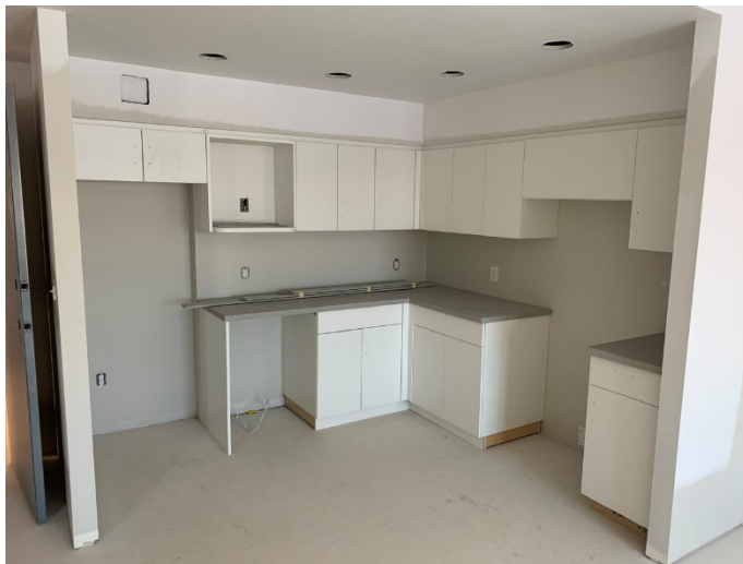
LVL 2 1 BR Millwork Install Progress