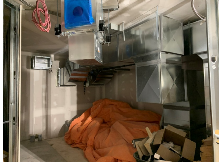
Mechanical Room HVAC Ductwork