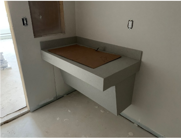
LVL 2 Accessible Suite Vanity Install