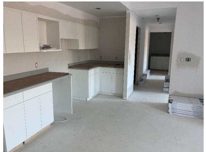
LVL 2 2 BR Millwork Install Progress