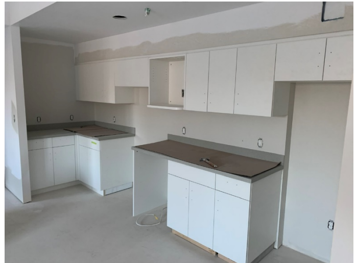
LVL 2 Millwork Mock-Up Suite Progress