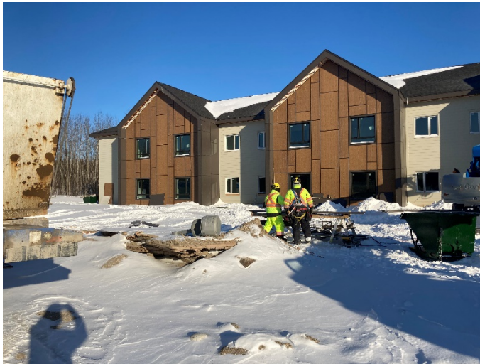
Exterior View – South