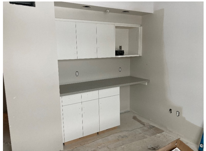
LVL 2 Short Stay Millwork Install Progress