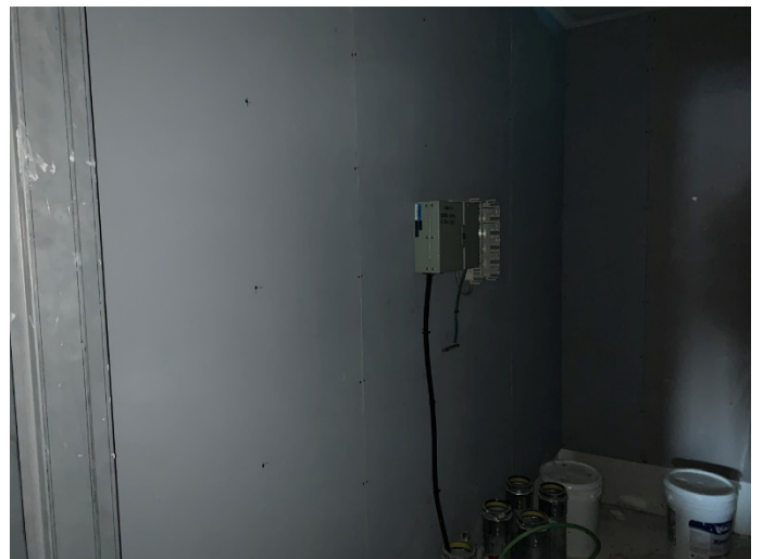
MTS Device Installation in Comm. Room