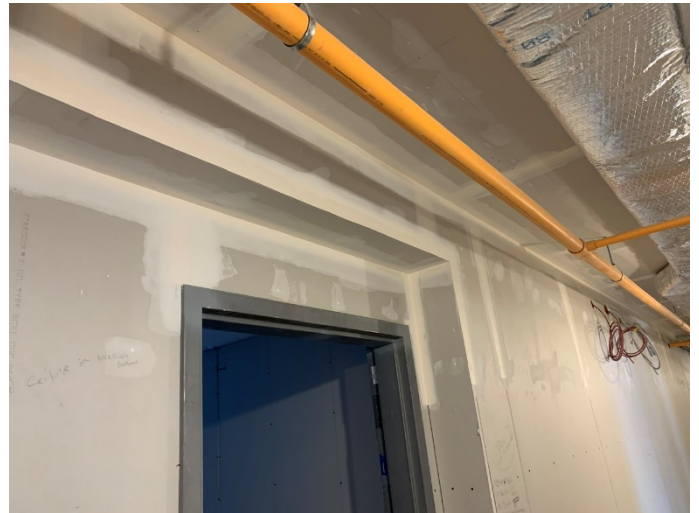
LVL 2 Corridor Progress