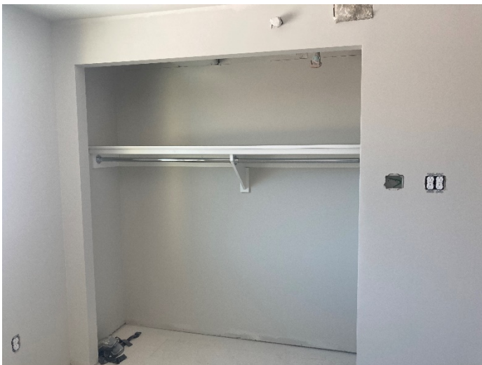
LVL 2 Mock-Up Suite Millwork Shelving Install