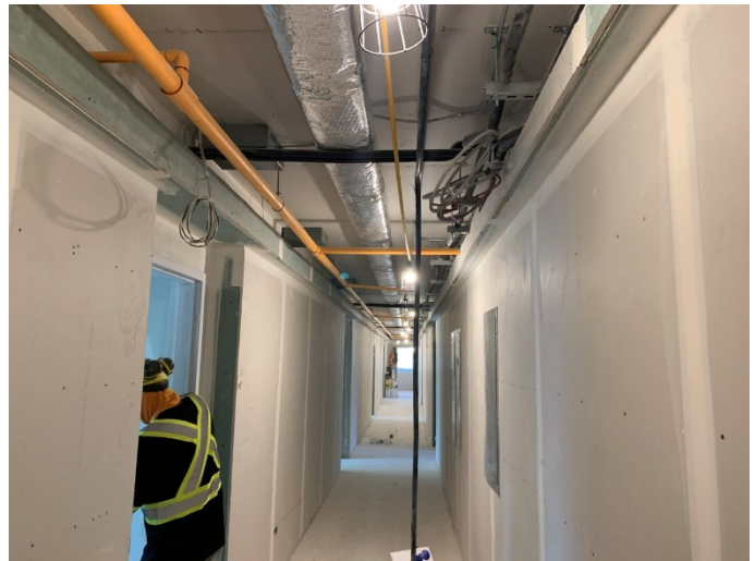
LVL 2 Corridor Progress