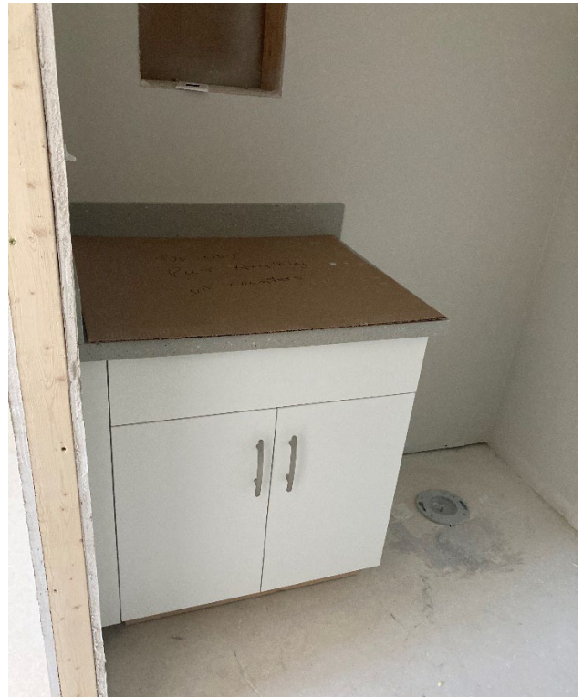
LVL 2 Vanity Mock-Up Suite Install