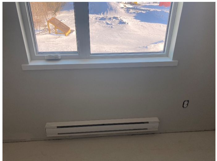
LVL 2 Mock-Up Suite Windowsill Install