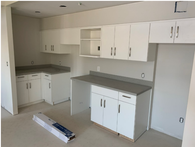
LVL 2 Millwork Mock-Up Suite Install