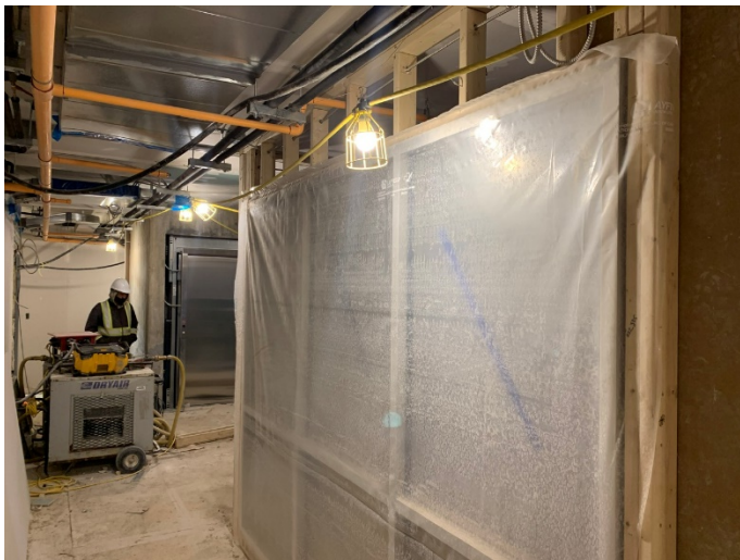
Curtain Wall Protection