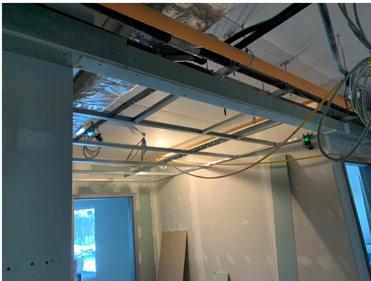
LVL 2 Elevator Lobby Ceiling Framing