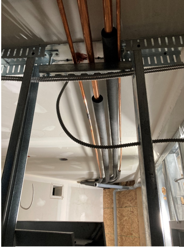
LVL 1 Refrigerant Piping Install