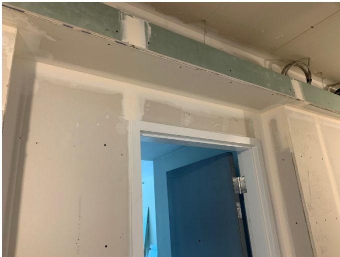
LVL 2 Corridor Bulkhead Progress