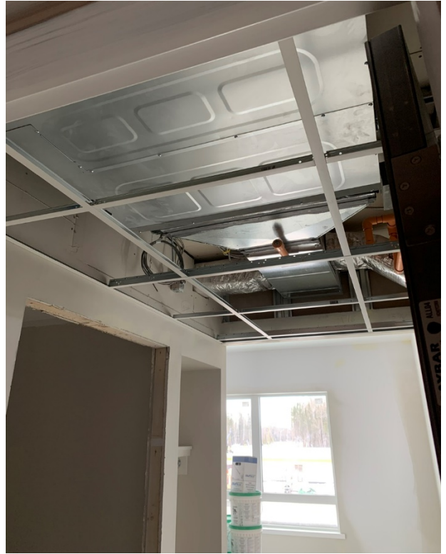
LVL 2 Suspended Ceiling Framing Progress