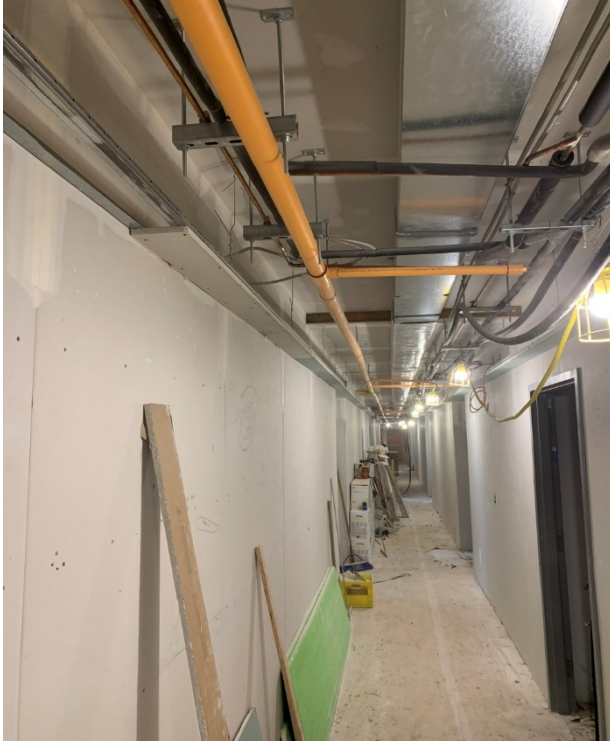
LVL 1 Corridor Progress