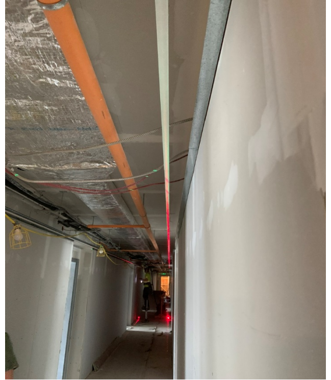
LVL 1 Corridor Progress