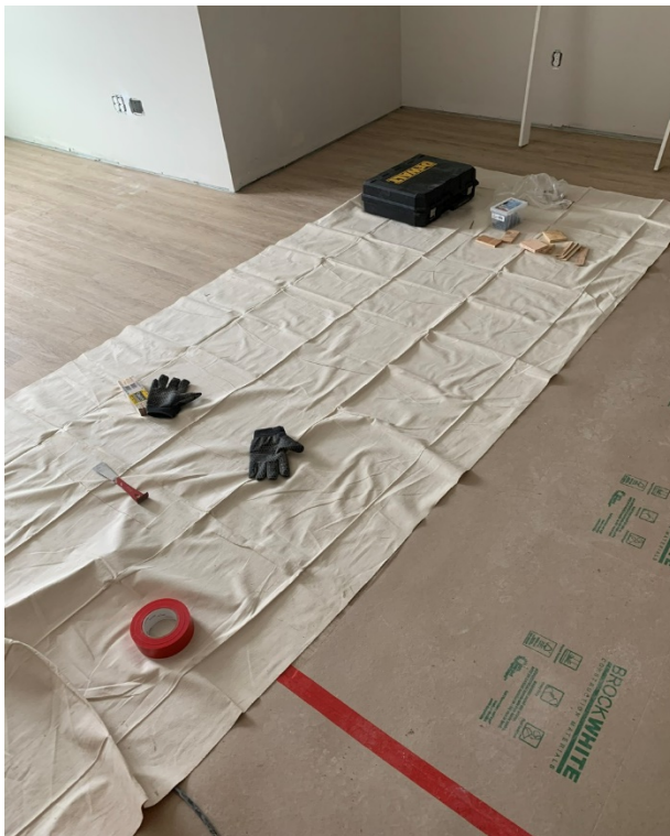
LVL 2 EW Flooring Protection