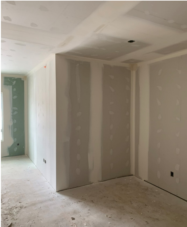
LVL 1 EW Taping/Finishing Progress