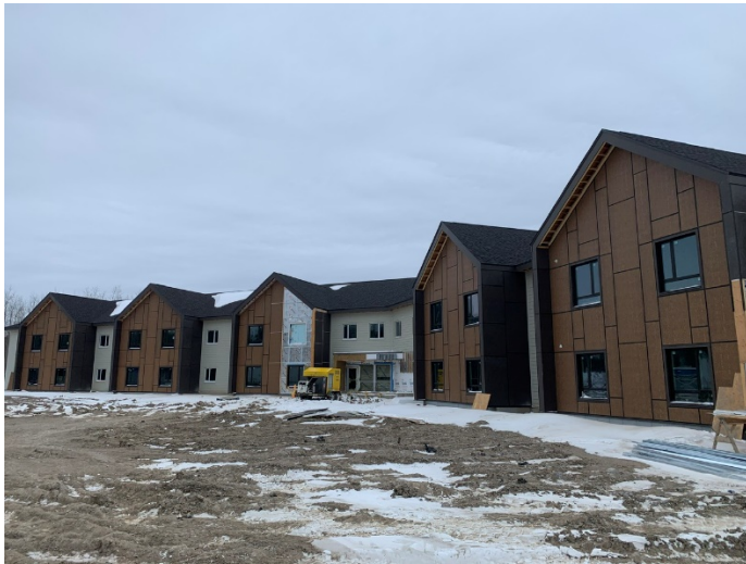
Exterior Progress - South