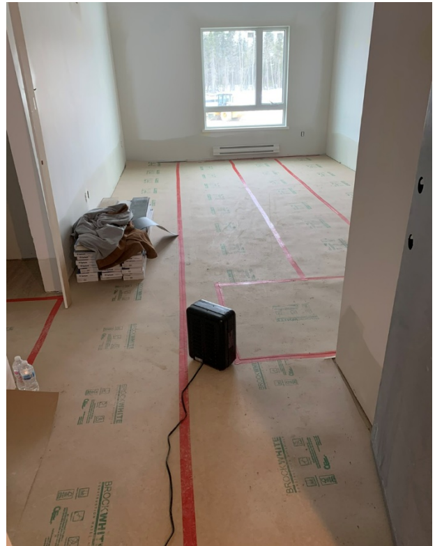
LVL 2 EW Flooring Protection