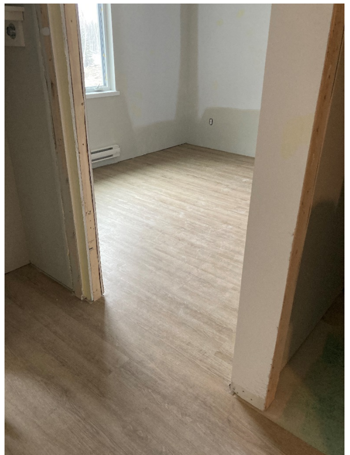
LVL 2 EW Flooring Install