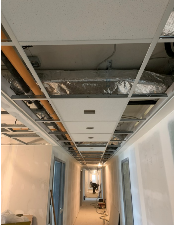
LVL 2 Corridor Acoustic Ceiling Progress