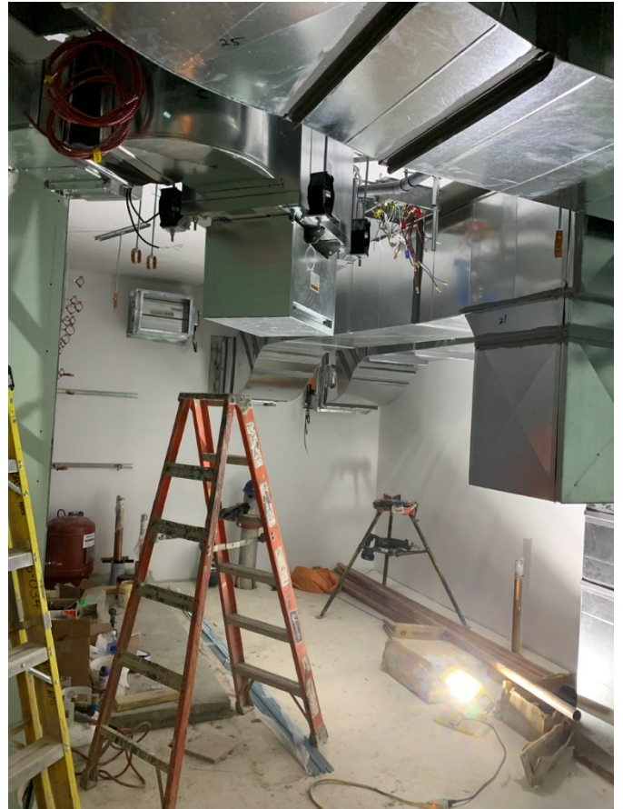
Mechanical Room HVAC Ductwork