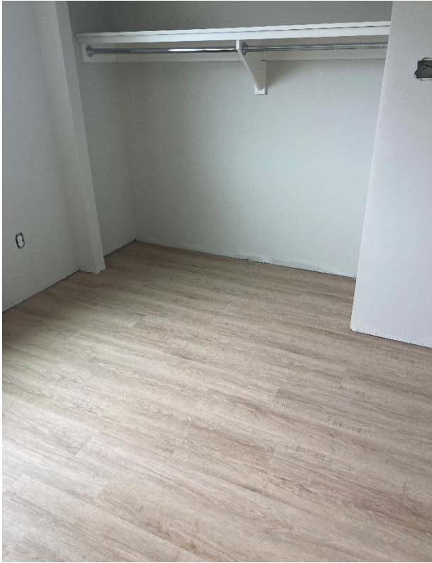
LVL 2 EW Flooring Install