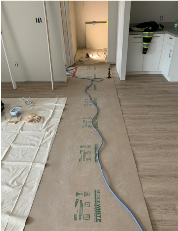
LVL 2 EW Flooring Protection