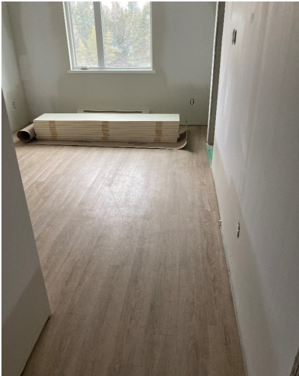
LVL 2 EW Flooring Install