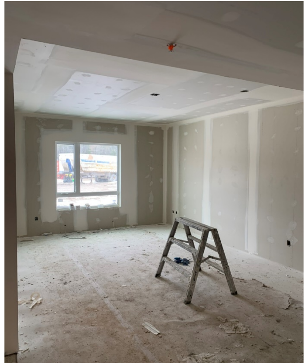
LVL 1 EW Taping/Finishing Progress