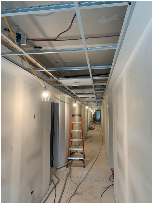
LVL 2 Corridor Progress