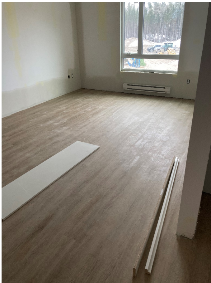
LVL 2 EW Flooring Install