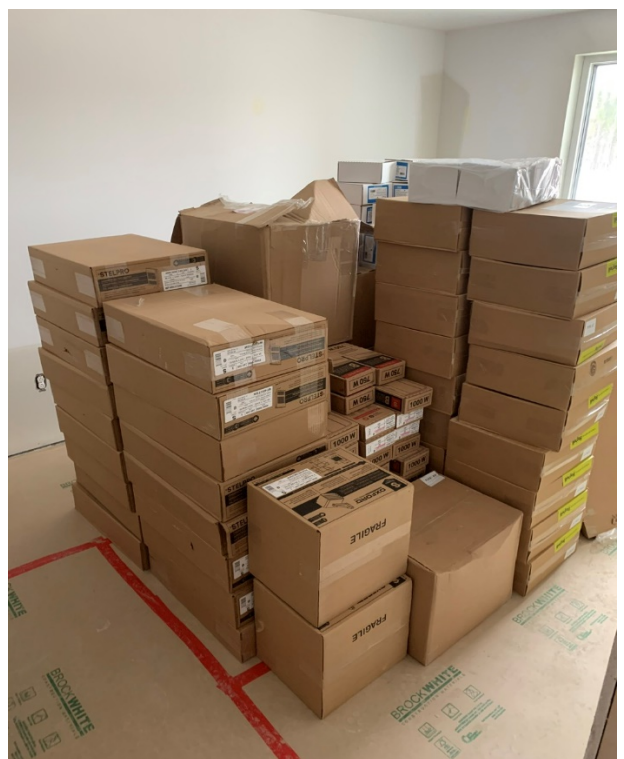
Electrical Light Fixtures