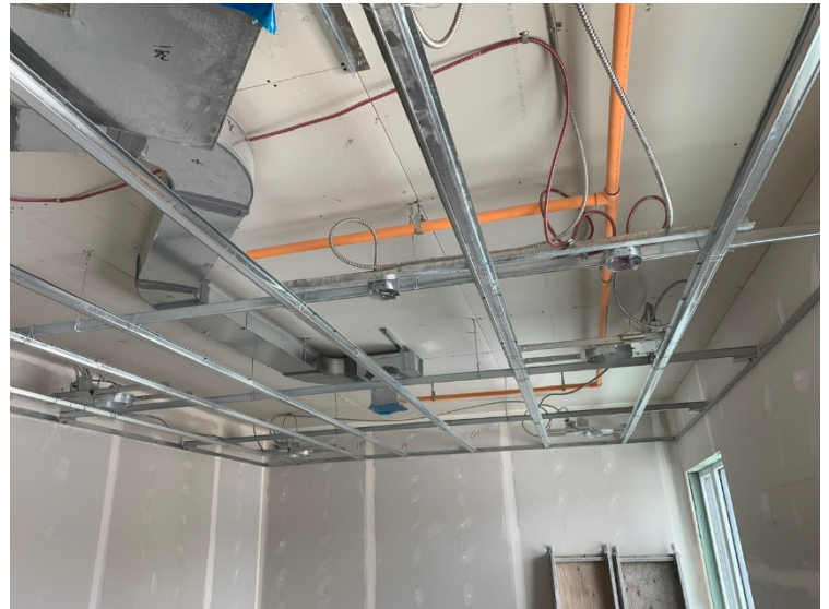
LVL 2 Stair 1 Ceiling Framing Progress