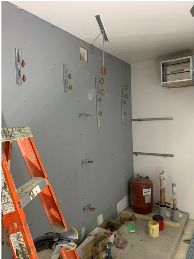
Mechanical Room Plumbing Hanger Installation