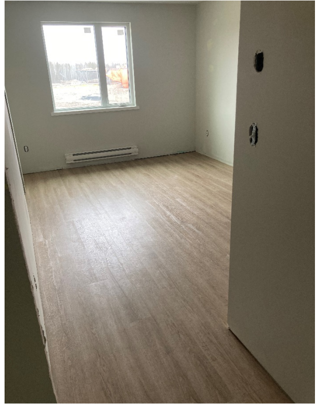
LVL 2 EW Flooring Install