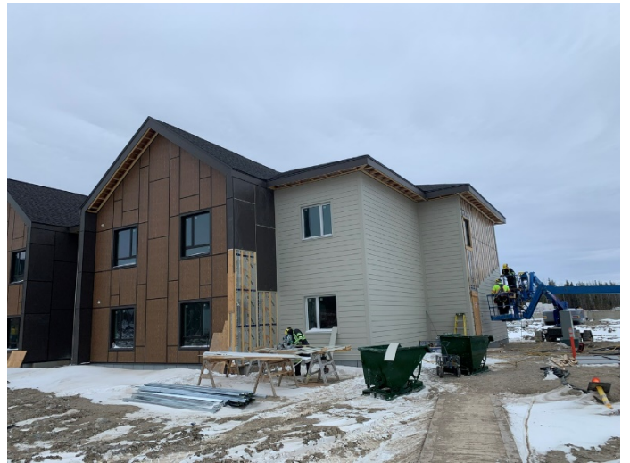
Exterior Progress - South East