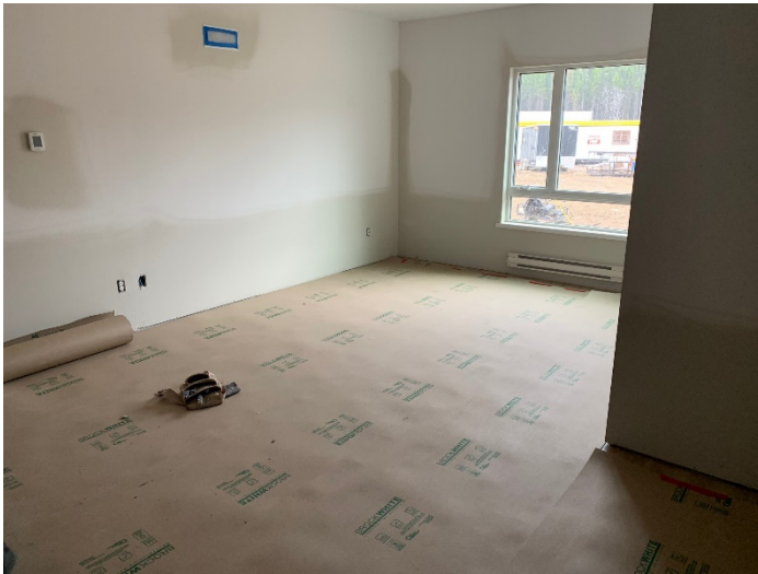
LVL 1 EW Progress