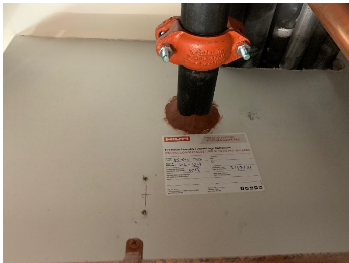
Sprinkler Piping Firestop System Labelling