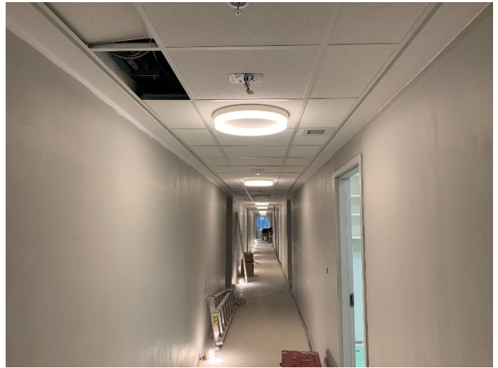
LVL 2 Corridor Progress