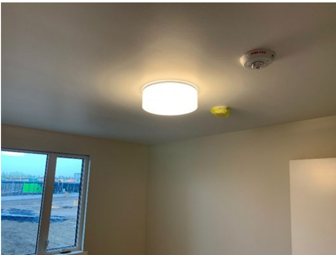
LVL 2 EW Lighting Install