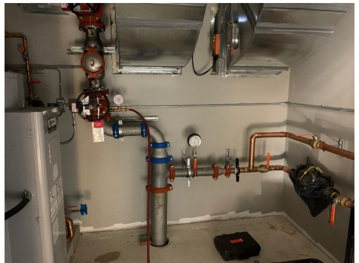
Mechanical Room Water Service Installation