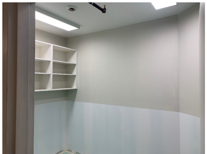
LVL 2 Housekeeping Progress