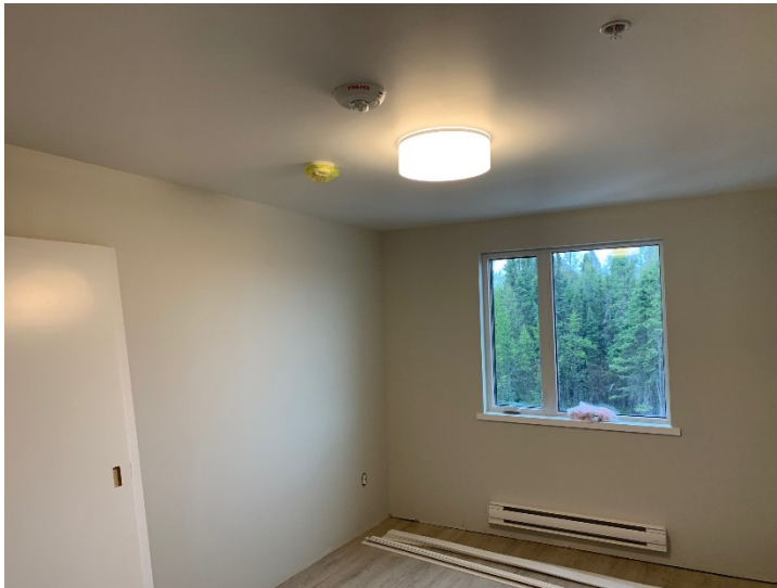
LVL 2 EW Lighting Install