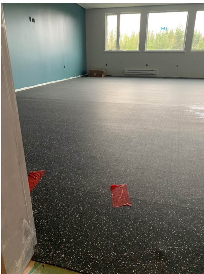
LVL 1 Fitness Centre Flooring Progress