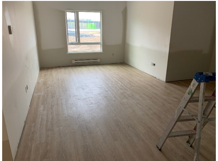
LVL 1 EW Flooring Progress