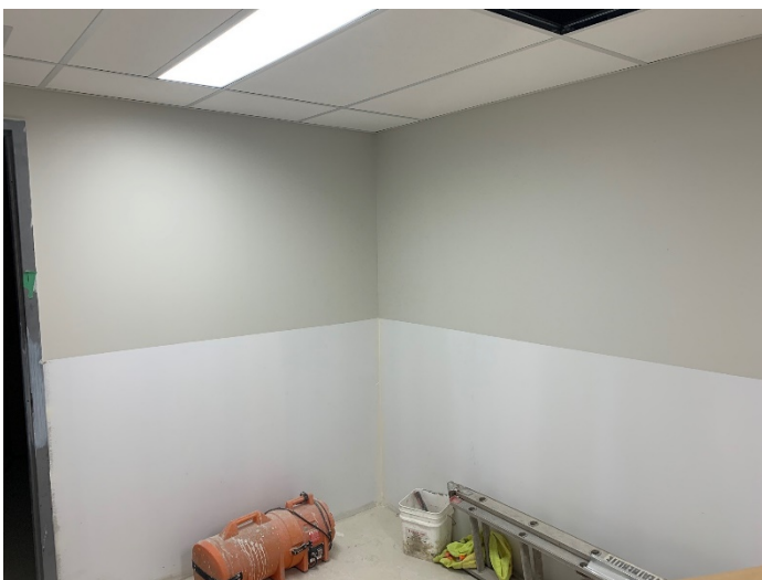
LVL 2 Storage Progress