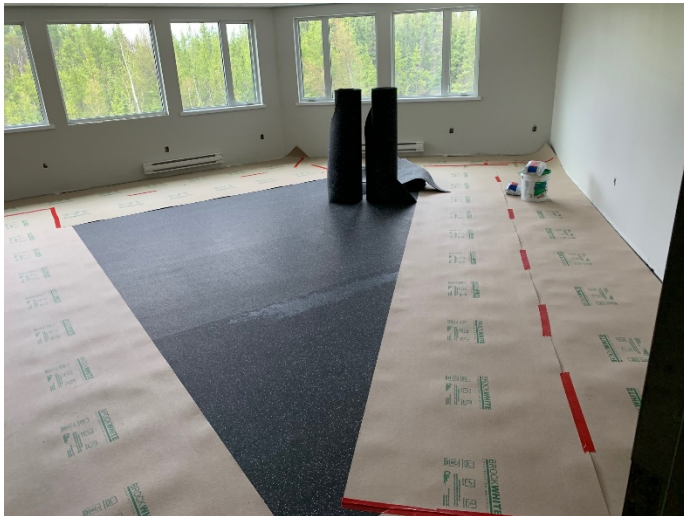
LVL 1 Fitness Centre Flooring Progress