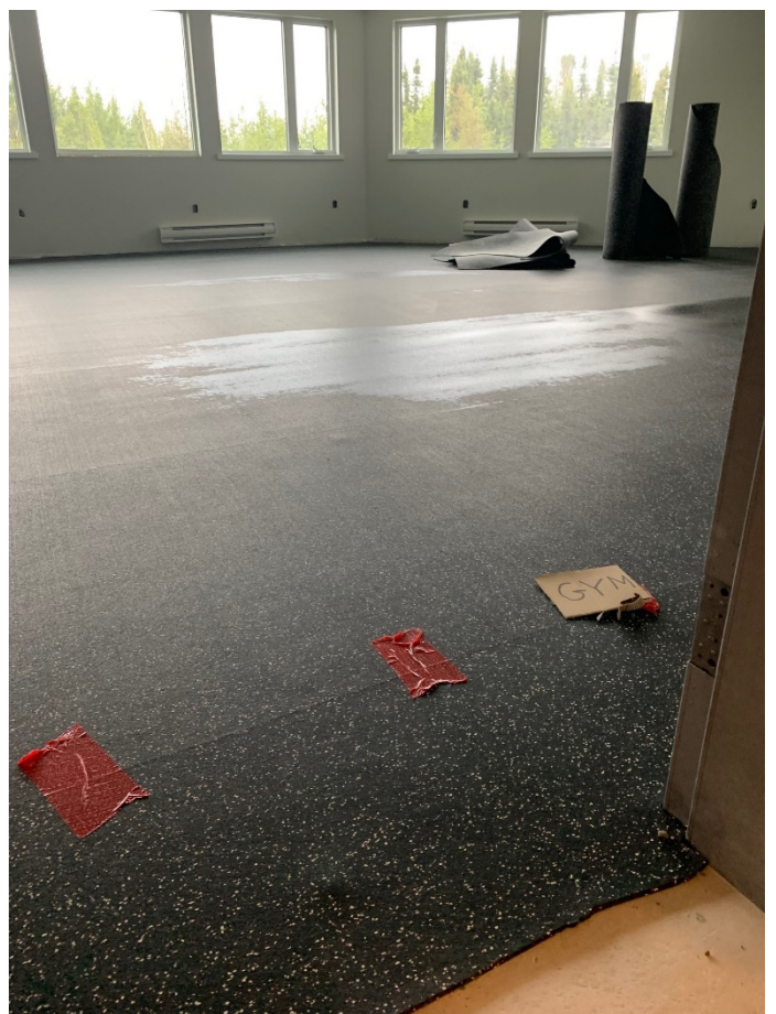
LVL 1 Fitness Centre Flooring Progress