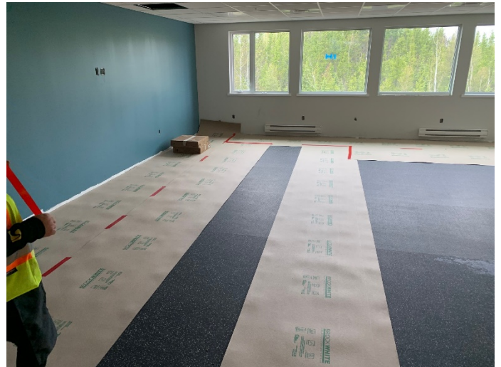
LVL 1 Fitness Centre Flooring Progress