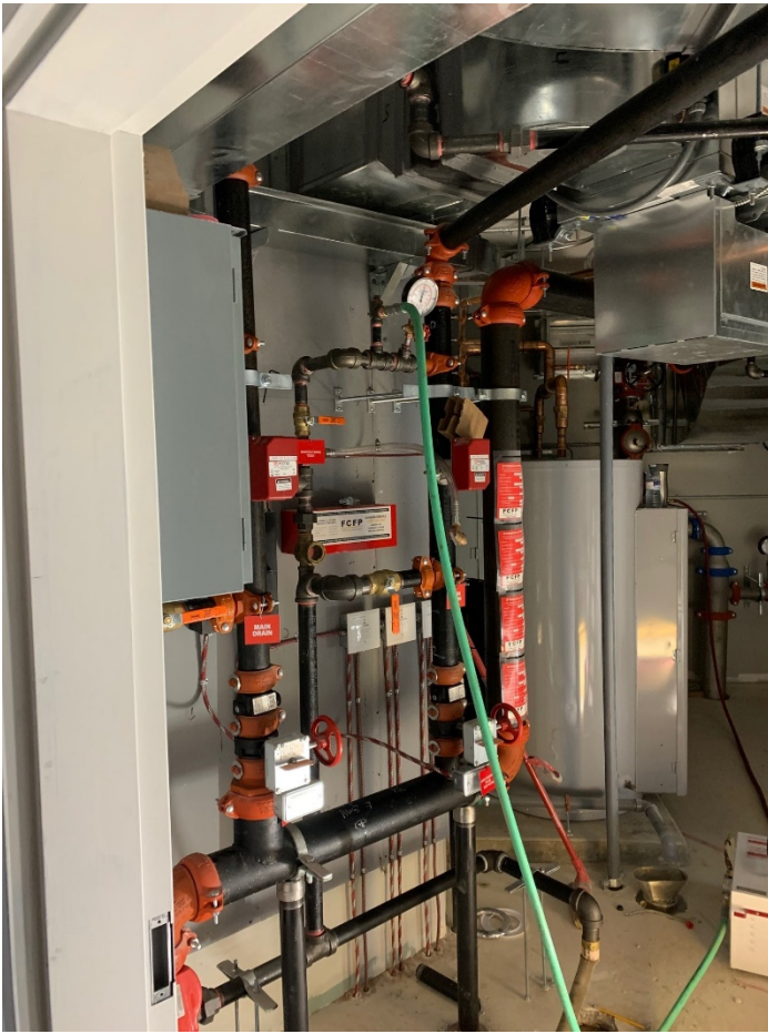
Mechanical Room Sprinkler System Installation