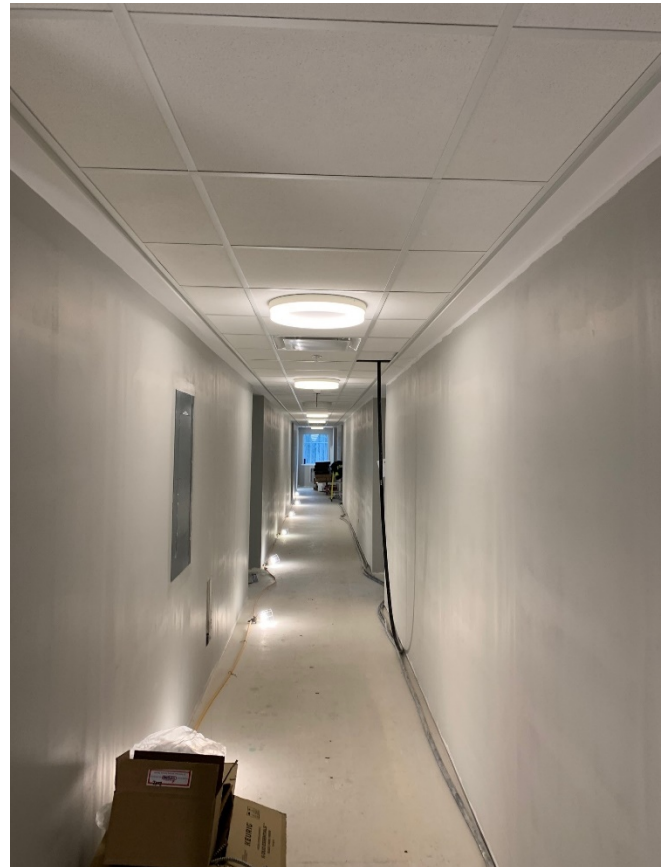
LVL 2 Corridor Progress