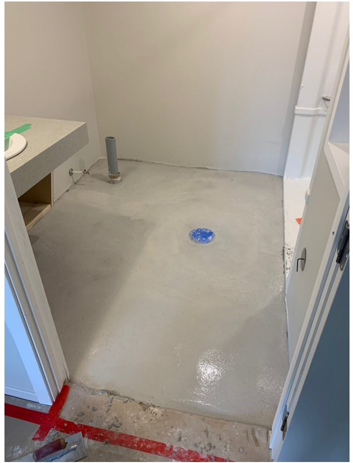
LVL 2 Accessible Suite Sunken Floor Install