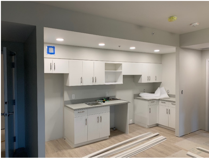
LVL 2 EW Progress